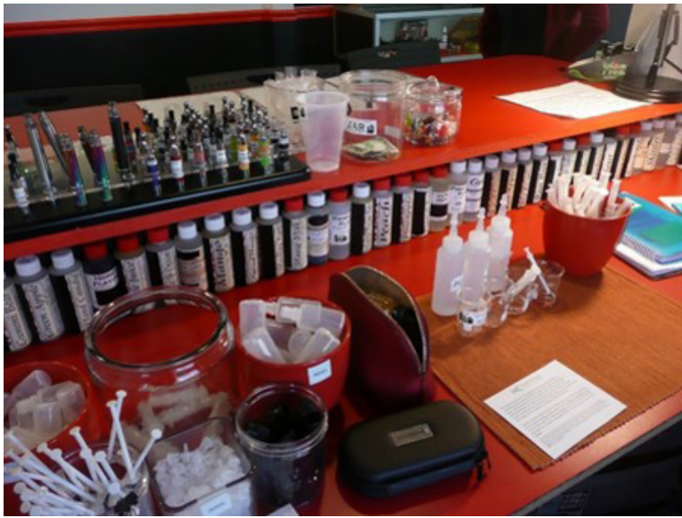
Figure 1. Photo of juice bar mixing station.

The shop employees and manager reported that the flavoring chemicals make up approximately 20% of the e-liquid. The remaining 80% is propylene glycol, vegetable glycerin, and nicotine. The vegetable glycerin to propylene glycol ratio can be specified by the customer, and it was reported that customers typically use more vegetable glycerin than propylene glycol. The amount of nicotine added was based upon the amount a customer requested. If customers did not know how much nicotine they wanted, the employees discussed the customer's previous cigarette or cigar smoking history and made a recommendation based upon how much they typically smoked. The shop's stock nicotine solution is 100 milligrams per milliliter. The stock solution is diluted to shop-defined concentrations that correspond to smoking from one half of a pack up to 2.5 packs of tobacco cigarettes. This nicotine level can be adjusted according to customers' preferences.