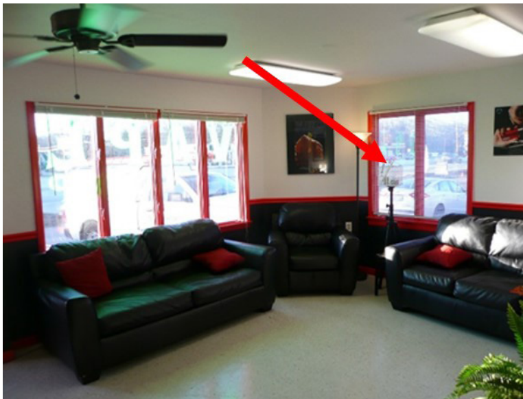
Figure 3. Area sampling basket in the front lounge area.