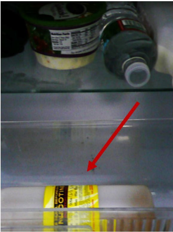
Figure 5. Stock nicotine solution stored in the bottom of a refrigerator that was also used to store food.