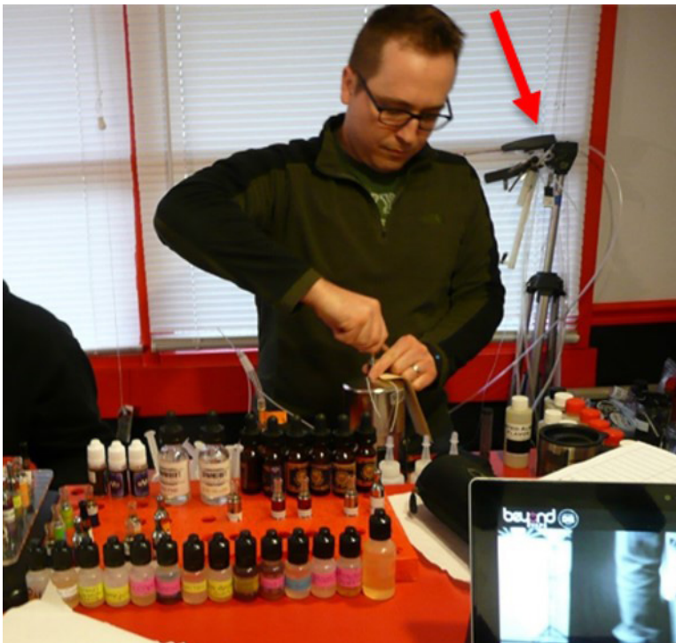
Figure 2. A National Institute for Occupational Safety and Health (NIOSH) investigator preparing to collect an air sample. An area sampling station is next to the window behind juice bar.