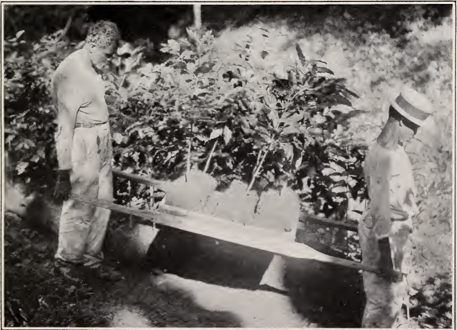
FIG. 2.—CARRYING SEEDLINGS FROM NURSERY TO FIELD.