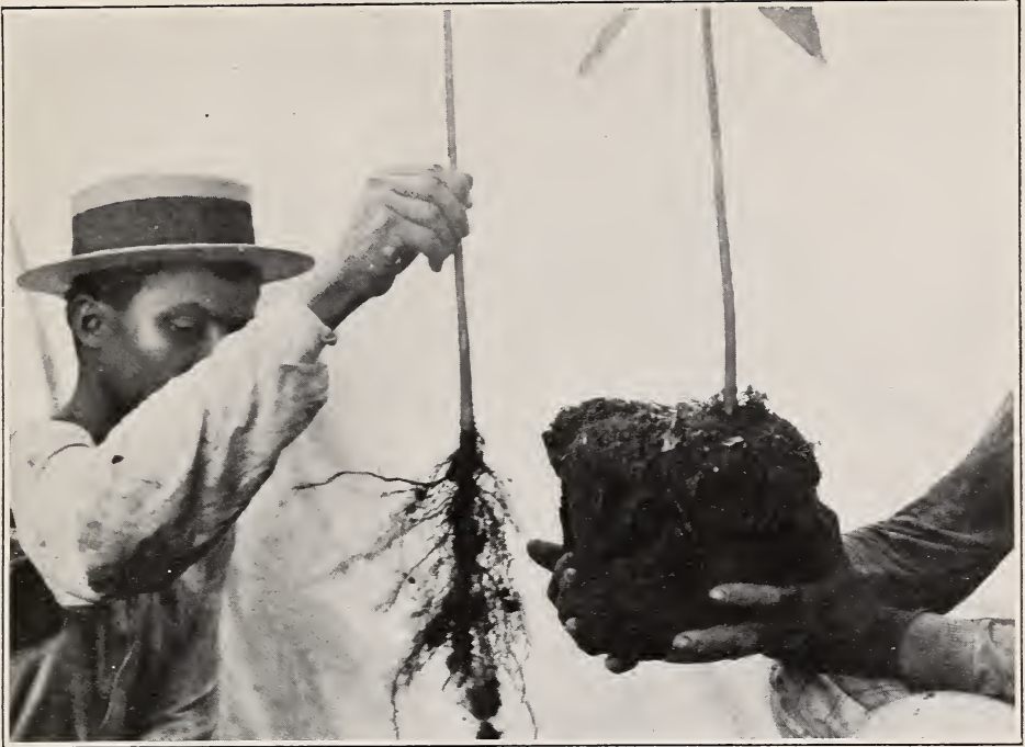
FIG. 1.—COFFEE ROOTS BARE AND IN BALL OF SOIL.