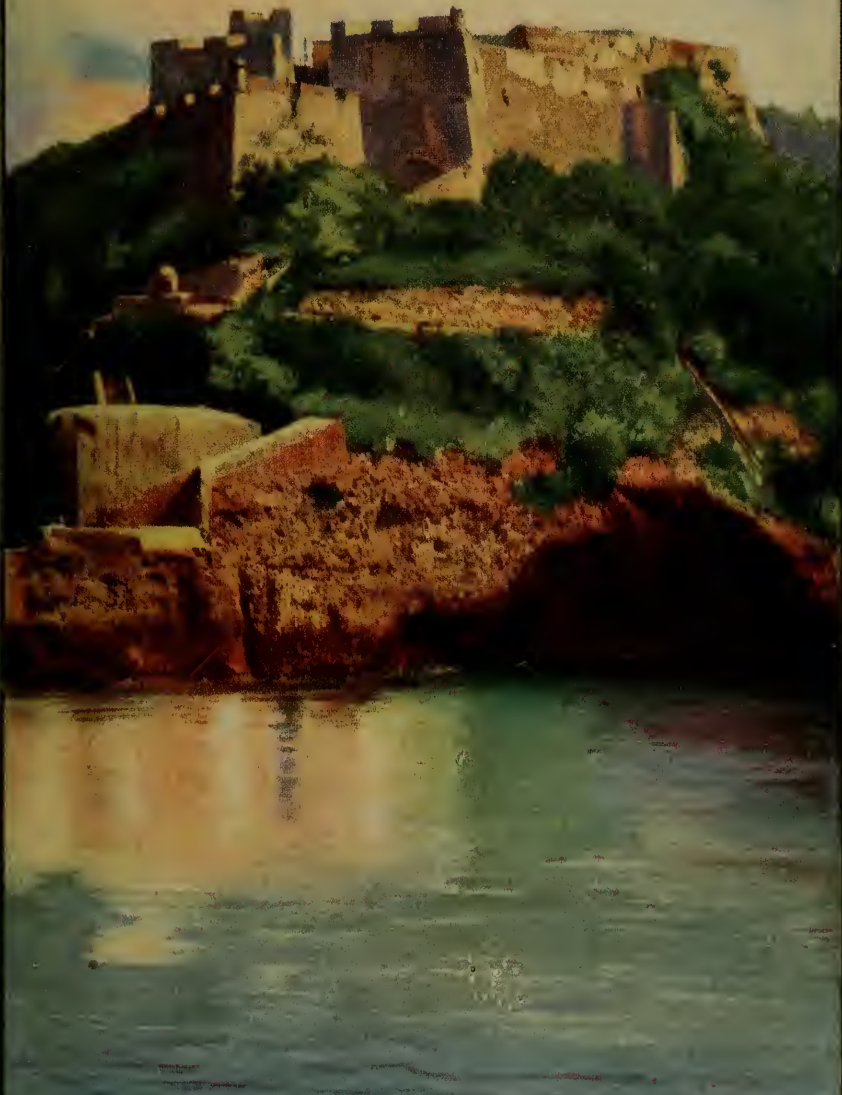
MORRO CASTLE, SANTIAGO.