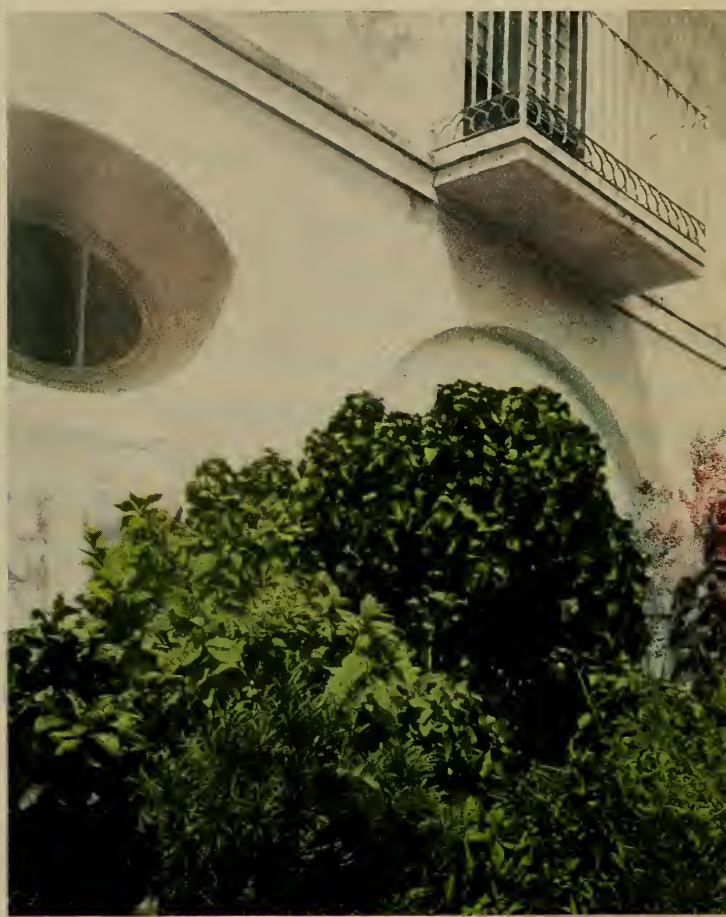
A CORNER IN THE PATIO