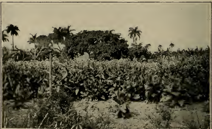
Tobacco Field Near Baire