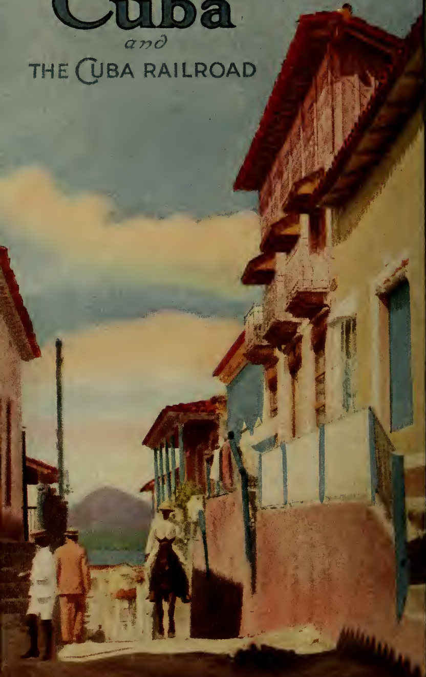
A STREET IN SANTIAGO.