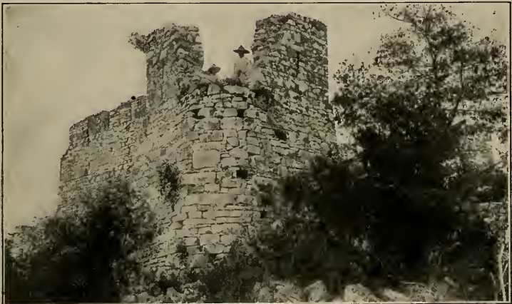
Old Fort—Jiguani—Cuba Railroad