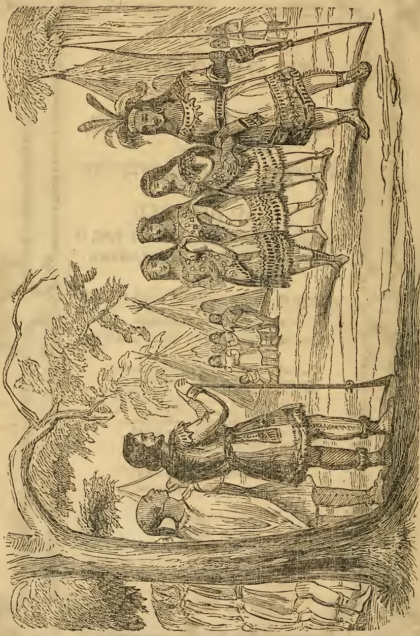
For an explanation of the above engraving see page 35.