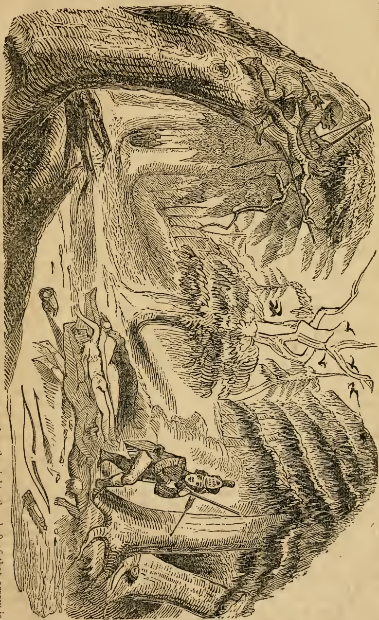
To the left is seen the Indian in the top of tree in the act of aiming to kill a man with an arrow, and on the right, the shaft of that arrow is seen in a tree near the head of the white man aimed at. See page 28.