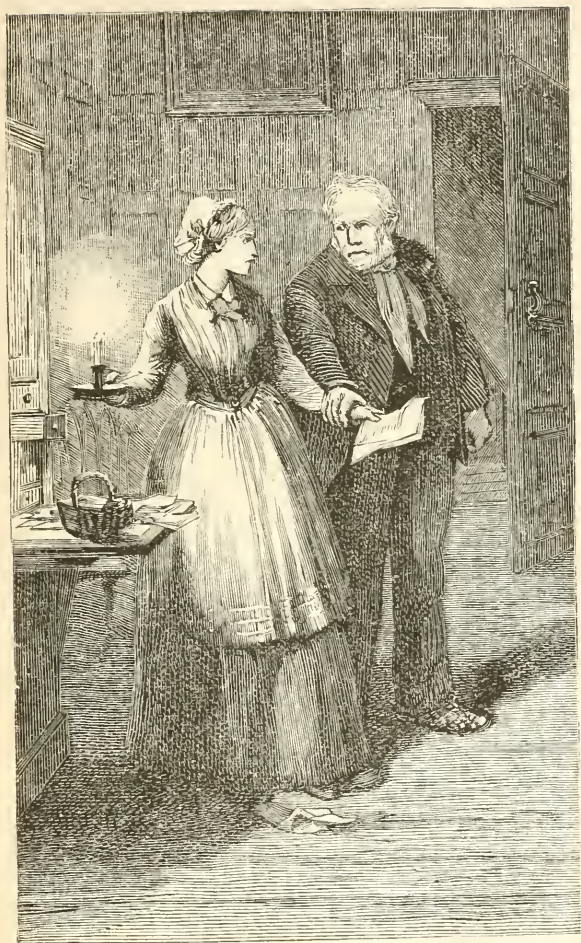
SHE TURNED, AND FOUND HERSELF FACE TO FACE WITH OLD MAZEY. —No NAME, Vol. XIII., page 391.