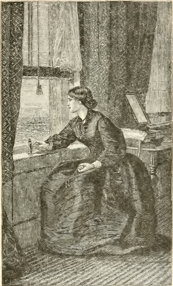
ONE HALF HOUR.—NO NAME, Vol. XIII., page 147.