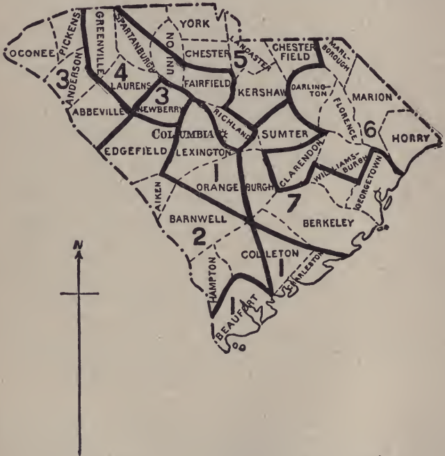
An illustration of "compact and contiguous territory."