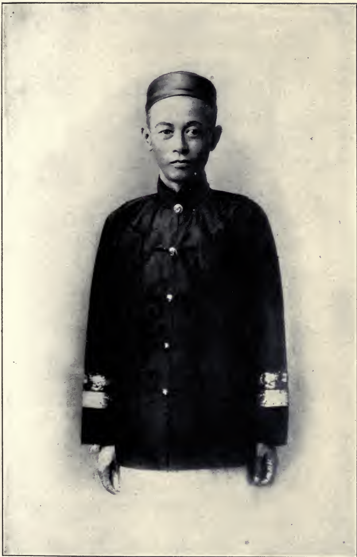
Commodore C. P. Sah, Imperial Chinese Navy.