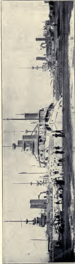
United States Fleet at Honolulu.