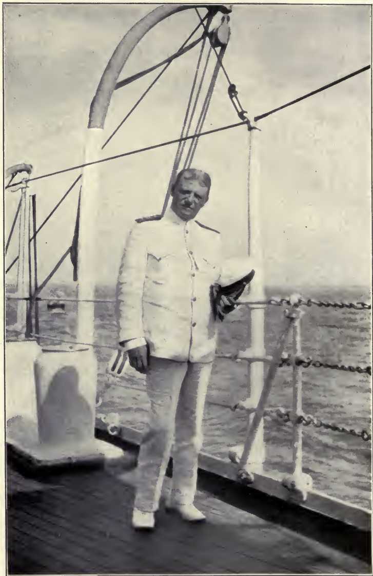
REAR-ADMIRAL ROBLEY D. EVANS.