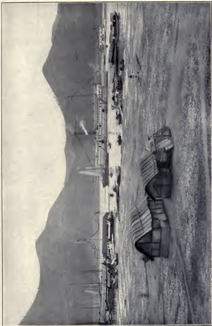
At Ichang, China.