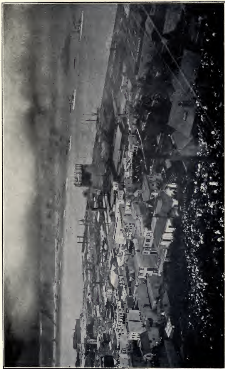
The Pacific Fleet entering the harbour of San Francisco.