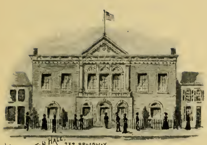
WASHINGTON HALL 232 BROADWAY. FRIENDLY SONS' BANQUET 1816.