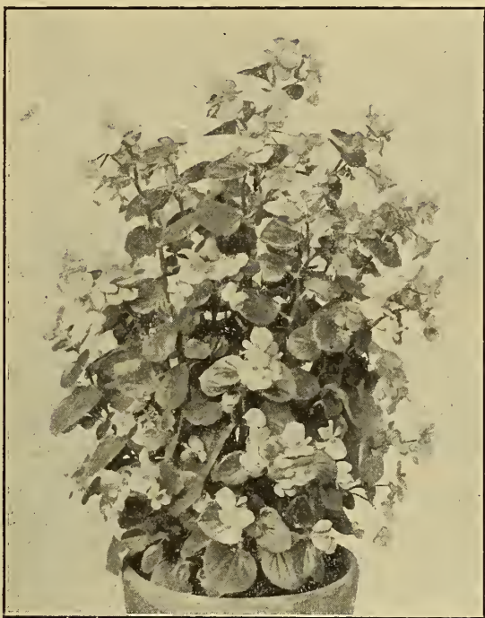
BEGONIA GLORIE DE CHATELINE

Glorie de Chateline. A very valuable variety that bids fair to become popular with the grower. It is an easy grower; free flowering; excellent both as a house plant and for bedding purposes. 2½-inch pot plants, $5.00 per 100, $45.00 per 1000.