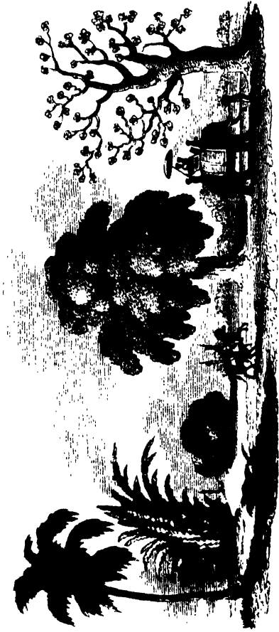
PARK OF BARRACKPOOR.