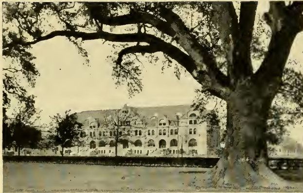
Gibson Hall, Tulane University