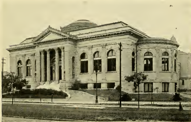
New Orleans Public Library