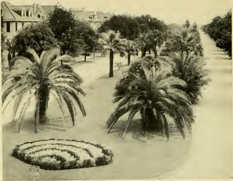
View in Up-town Residence Section