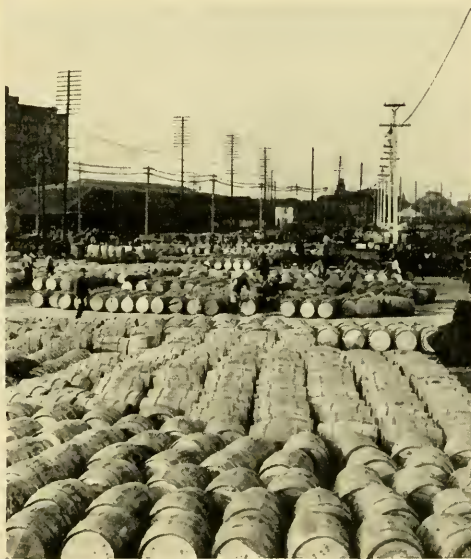
At the Sugar Wharf