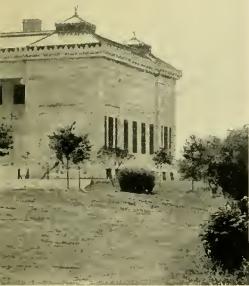
M OF ART