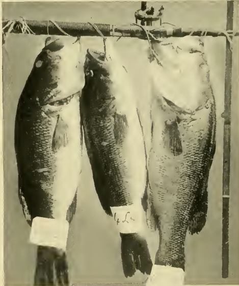
Green Trout (Large-Mouth Bass)