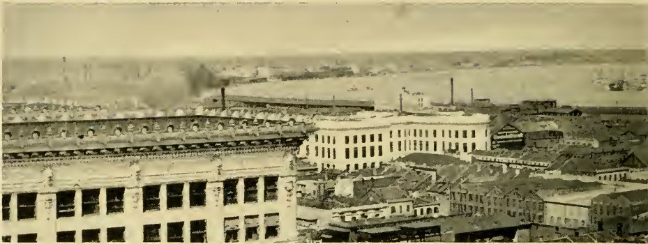
New Orleans Sky L