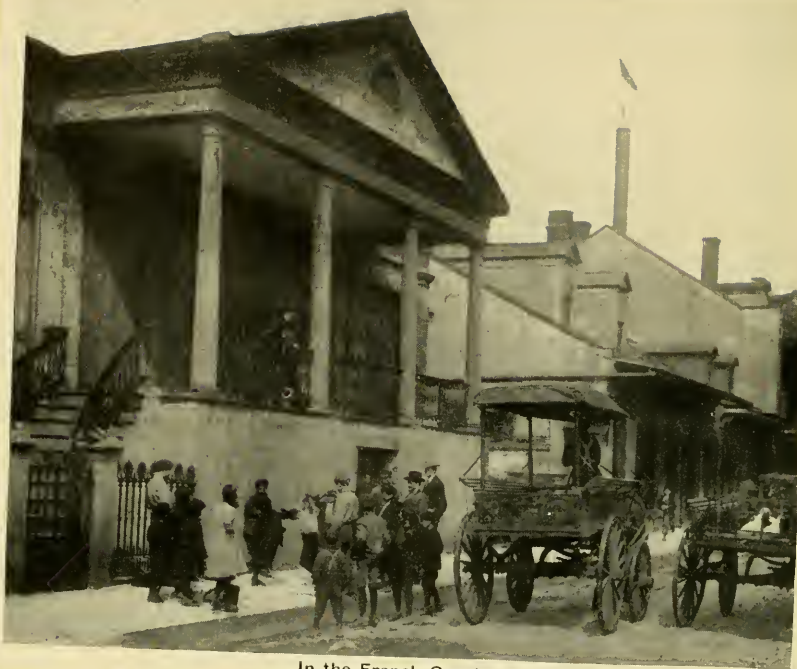
In the French Quarter