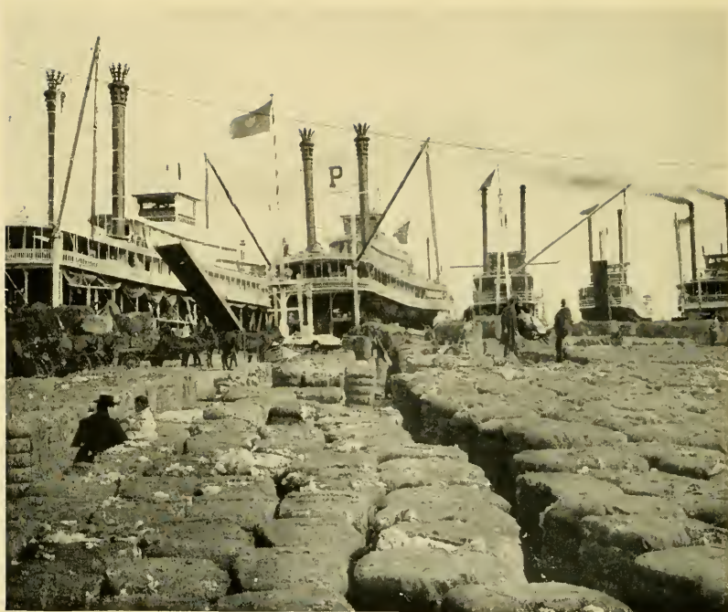
At the Cotton Wharf