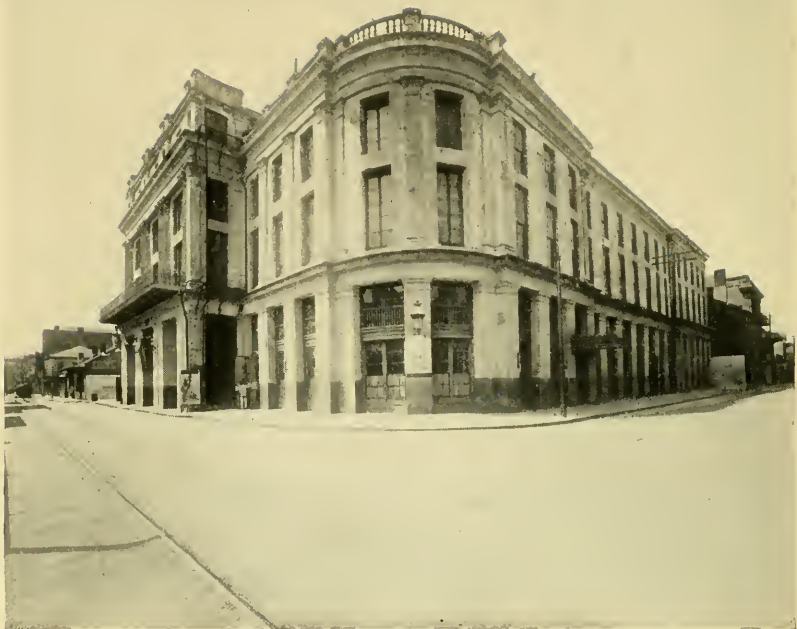
French Opera House