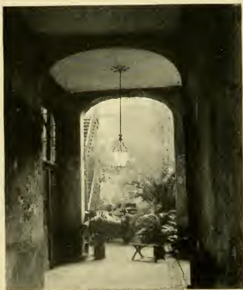
Typical Old Courtyard