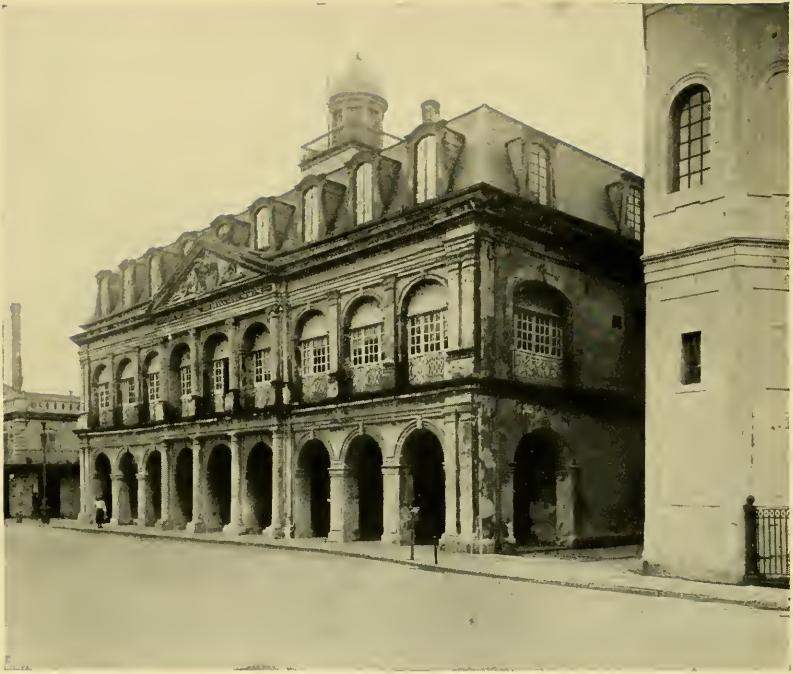
Old Spanish Cabildo