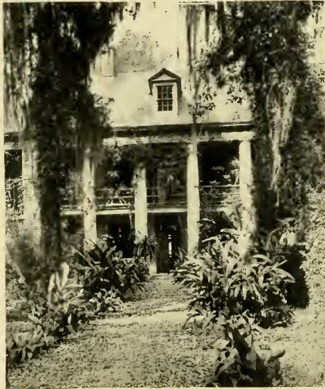
An Old Plantation Home