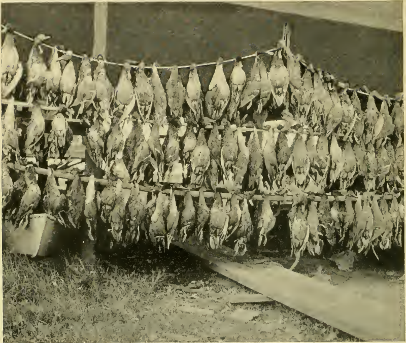
A Morning's Hunt