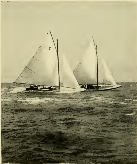
On Lake Pontchartrain