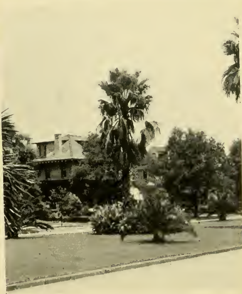
Another Residential View