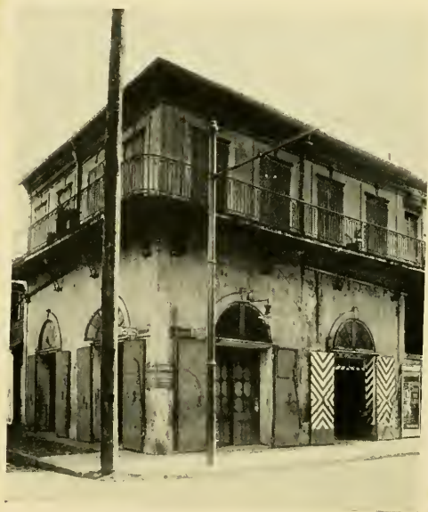
The Old Absinthe House (1823)