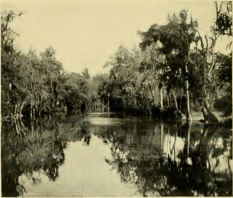
In the Evangeline Country