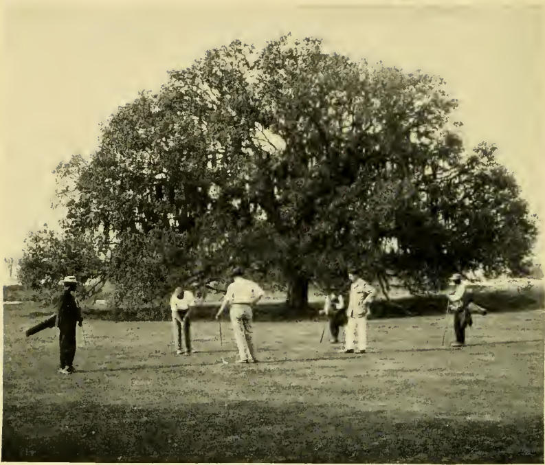
Country Club Golf Links