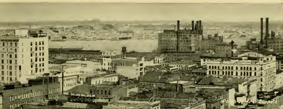
Viewing Crescent Bend

New Orleans is the gateway, not only to this great waterway, which is soon to revolutionize the commerce of the world, but the gateway to all South American commercial opportunities of which so much is expected.