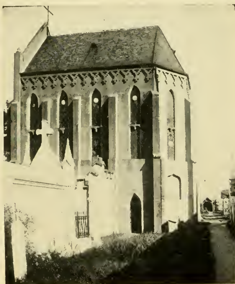
St. Roch's Chapel