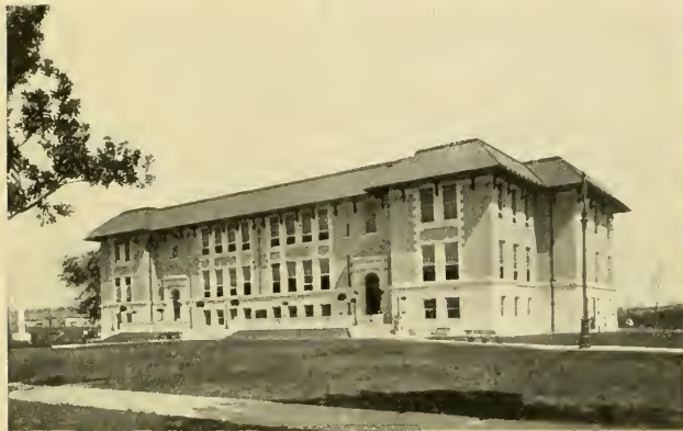
Beauregard Public School