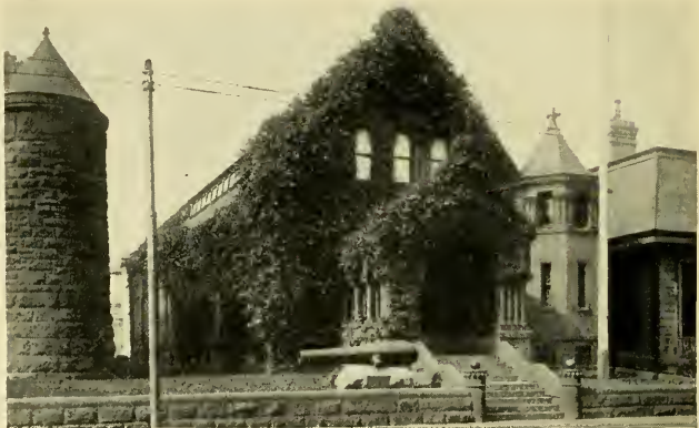
Confederate Memorial Hall