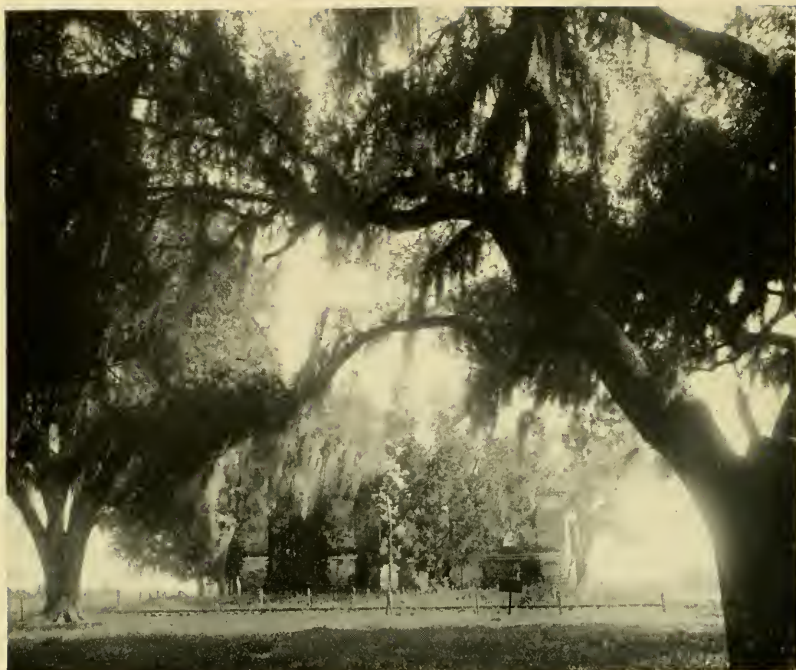
Headquarters of General Pakenham, Battle of New Orleans, 1815