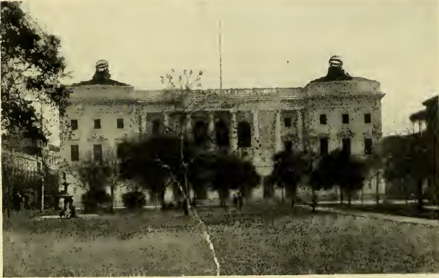
U. S. Court Building and Postoffice