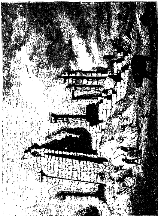
View of the Temple of Soleb from the North-east.