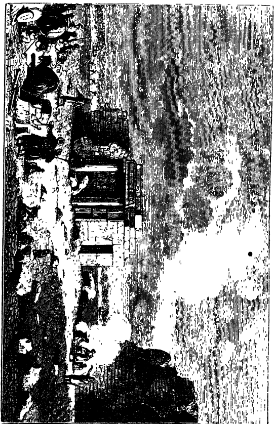
View of the Temple of Samnó.