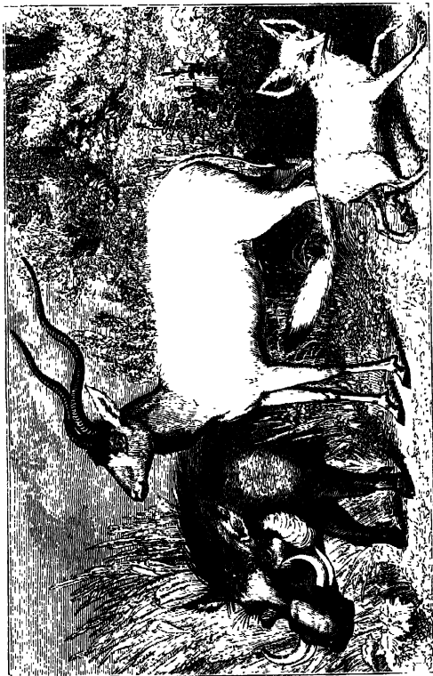
Photo. of Mr.