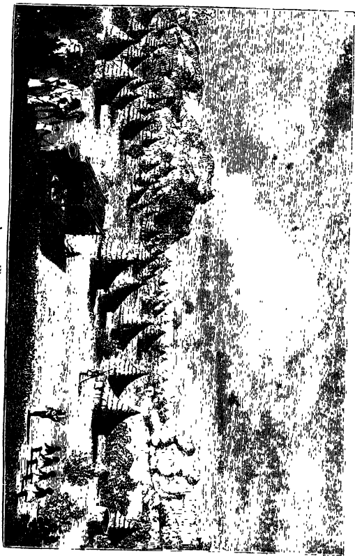
View of Ft. Chisum