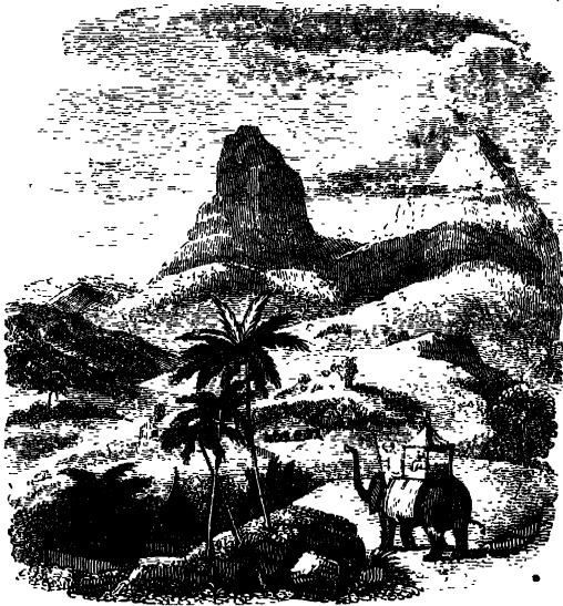
Mountains between Lasta and Samen.

and did not conceal their aversion to such hostilities. Victory indeed at length declared in their favour, and thousands of the warlike Agows were left dead on the field; the sight of which suggested to the prince the following remarks addressed by him to his father. “ These men whom you see slaughtered on the ground were neither Pagans nor Mohammedans, at whose death we should rejoice; they were Christians, lately your subjects and your countrymen, some of them your relations. This is not victory which is gained over ourselves. In killing these you drive the sword into your own entrails. How