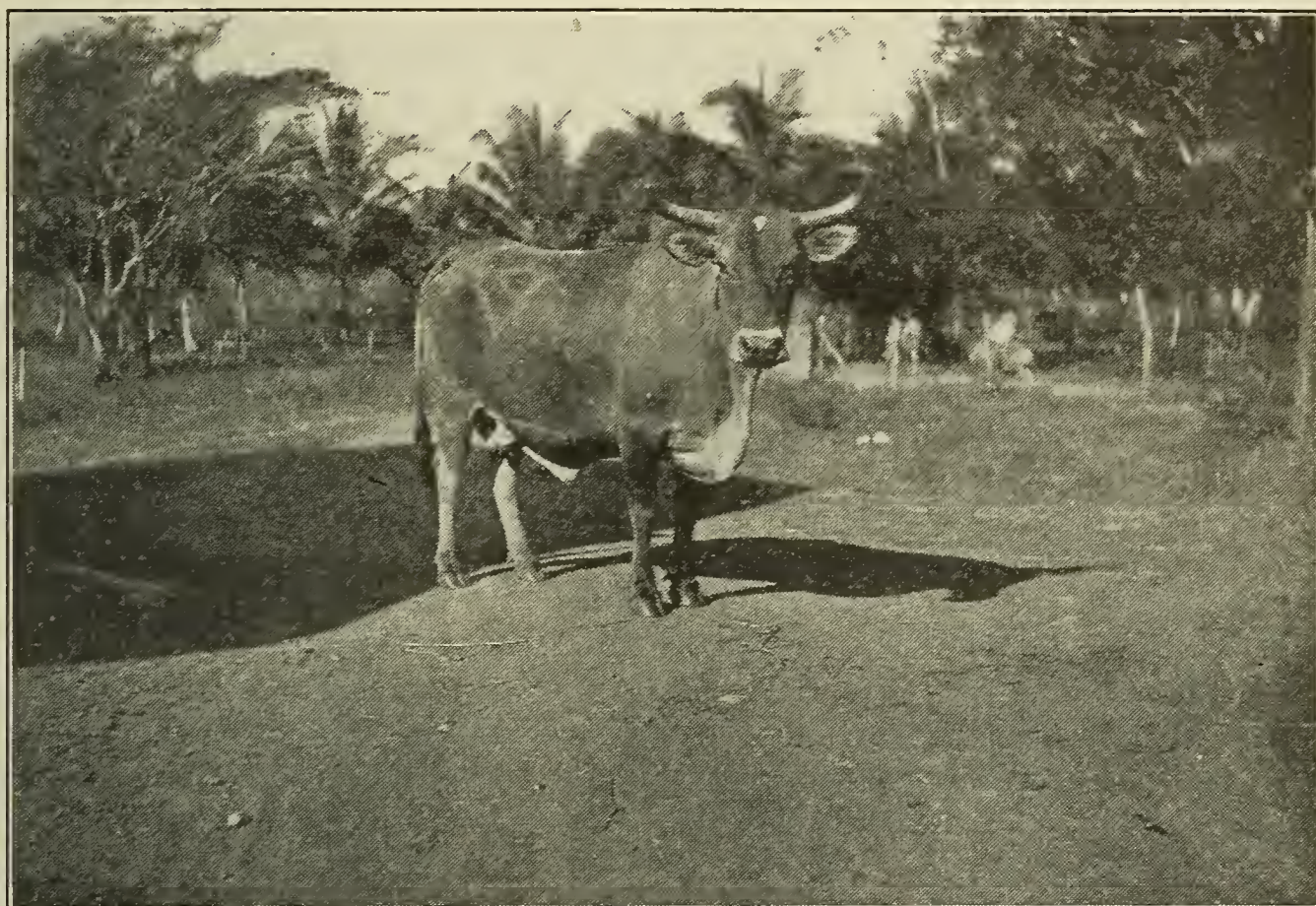
FIGURE 2.—Native cow

here. Some corn is grown, but much of it is imported for human consumption and often at less cost than native corn can be had. The station has at different times distributed several tons of seed of kafir, milo maize, and feterita. Though these grow well, especially in regions where the rainfall is deficient, none of them have found sufficient favor with the local farmers to warrant further planting. In addition to the malojillo and guinea grasses, which have been grown for range improvement for many years in Porto Rico, the elephant and Guatemala grasses imported by the station are extensively grown also. Uba cane is satisfactory for sugar production on some lands and yields large amounts of forage in all sections of the island. A successful legume is needed that will furnish protein in the ration