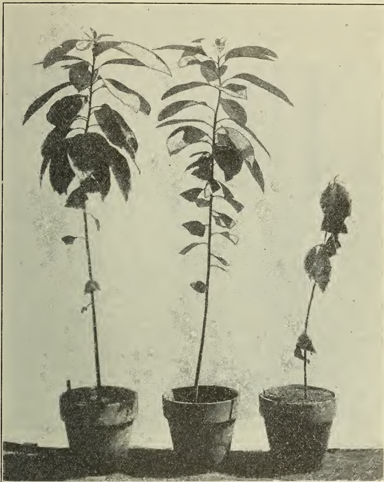
FIGURE 8.—Inoculation experiments with avocado. Left, two check plants; right, inoculated January 20, 1928, and photographed July 7, 1928. The plants were of equal height at the beginning of the experiment

The disease occurs frequently in heavy soils and in poorly drained locations. At the station young trees on fairly steep slopes have succumbed. The soil is a heavy clay. At Villalba the disease first appeared on a rather poorly drained plateau at the base of a precipitous slope from which the plateau received the run-off. The surface 15 inches of soil was a gravelly, friable loam. The subsoil was a yellow, tight clay. At this place many of the trees attained