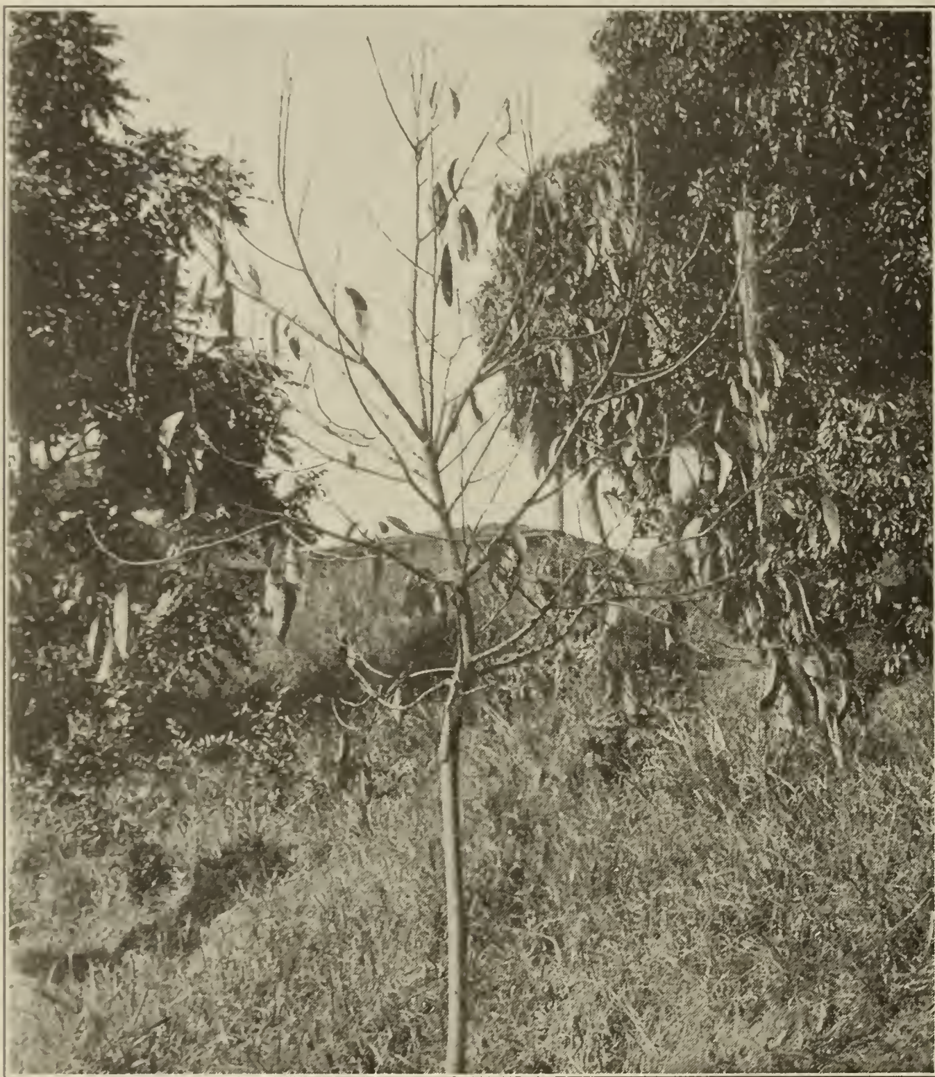
FIGURE 7.—Young Dickinson avocado grafted on West Indian stock dying from root disease. Located on a hillside in heavy clay soil

Inoculation experiments on West Indian seedlings grown in autoclaved soil demonstrated the ability of the fungus to attack and kill the roots. In most instances the effect of the parasite is rather slow. Of six plants that were inoculated January 30, 1928, four were dead