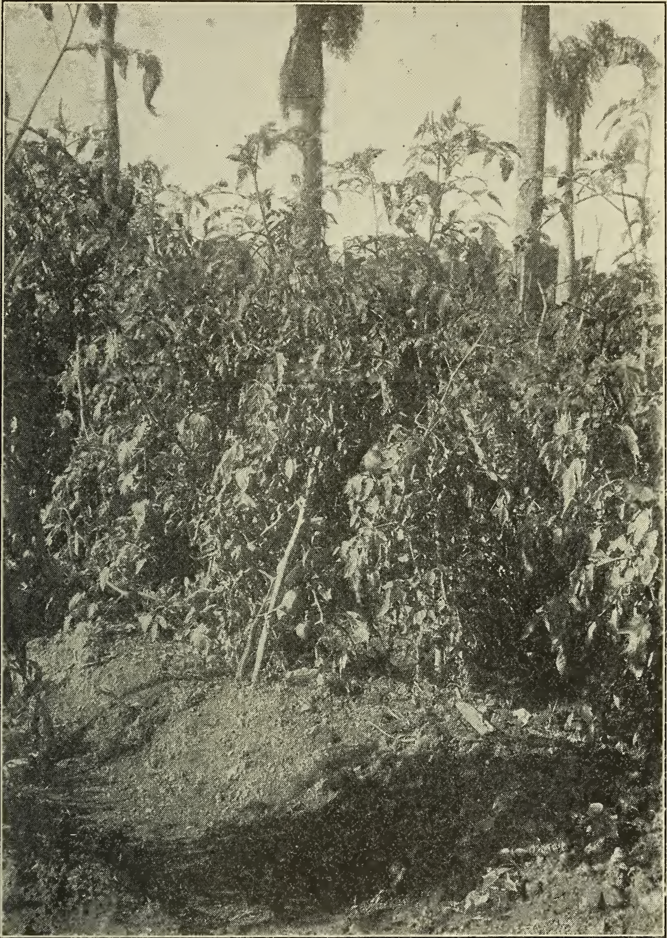
FIGURE 4.—Marglobe tomatoes

Certain varieties of tomatoes can be grown successfully. The Marglobe is at present the most promising variety. (Fig. 4.) Tomatoes should not be grown two years in succession on the same plat of ground.