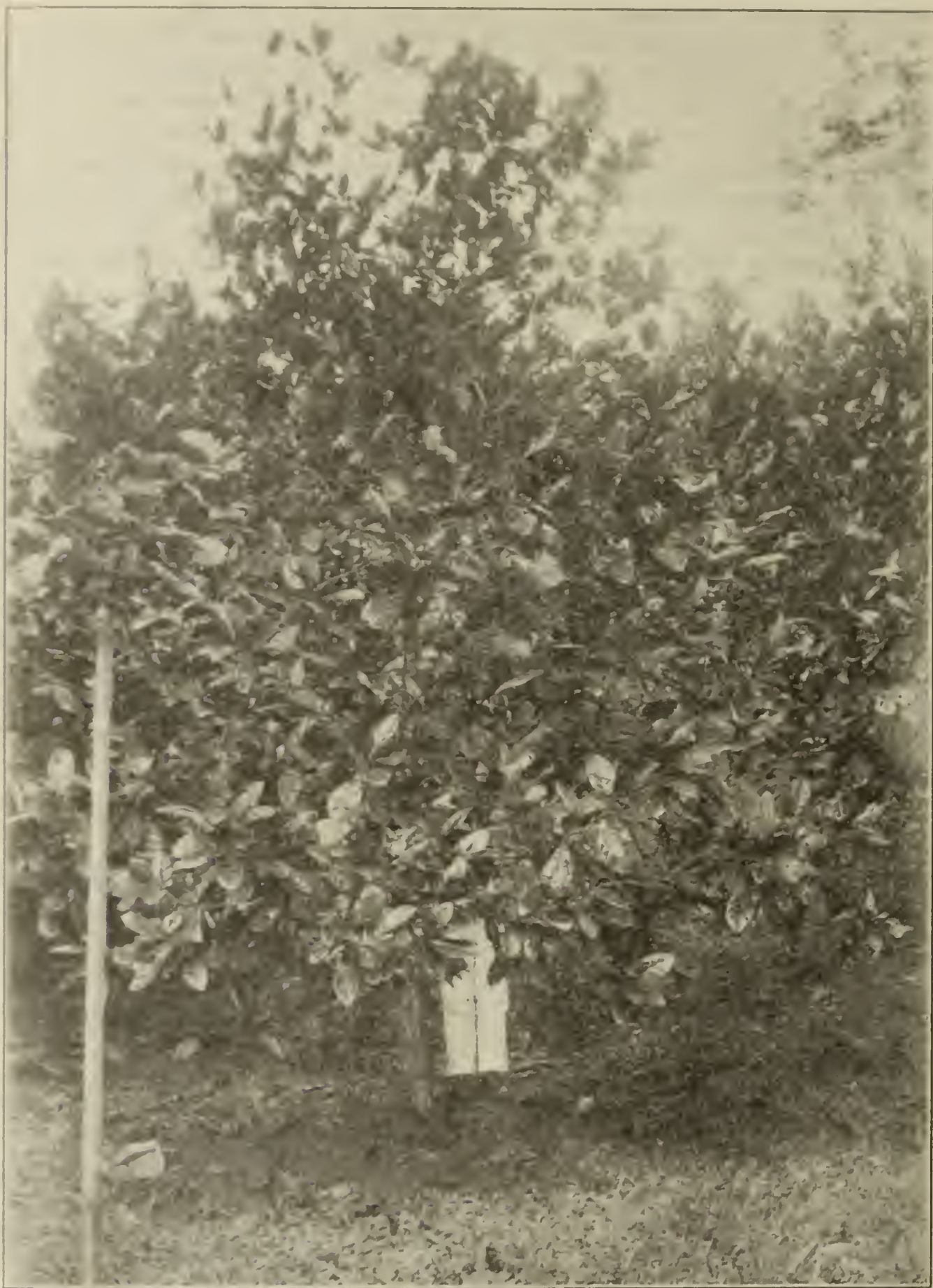
FIGURE 5.— Coffea excelsa at 13 years from seed

Such blossoming as had taken place prior to the removal of the plants showed that flowering for the third crop, as for the first and second, was retarded under the lengthened period of illumination.