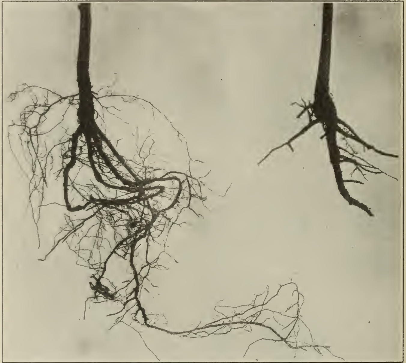
FIGURE 9.—Root disease of avocado. Left, root system of the plant on the left in Figure 8. Right, root system of the plant on the right in Figure 8. The only functioning roots are the few small ones arising near the crown

During the year a majority of the first generation Duncan-Triumph grapefruit hybrids came into bearing. The first-generation trees,