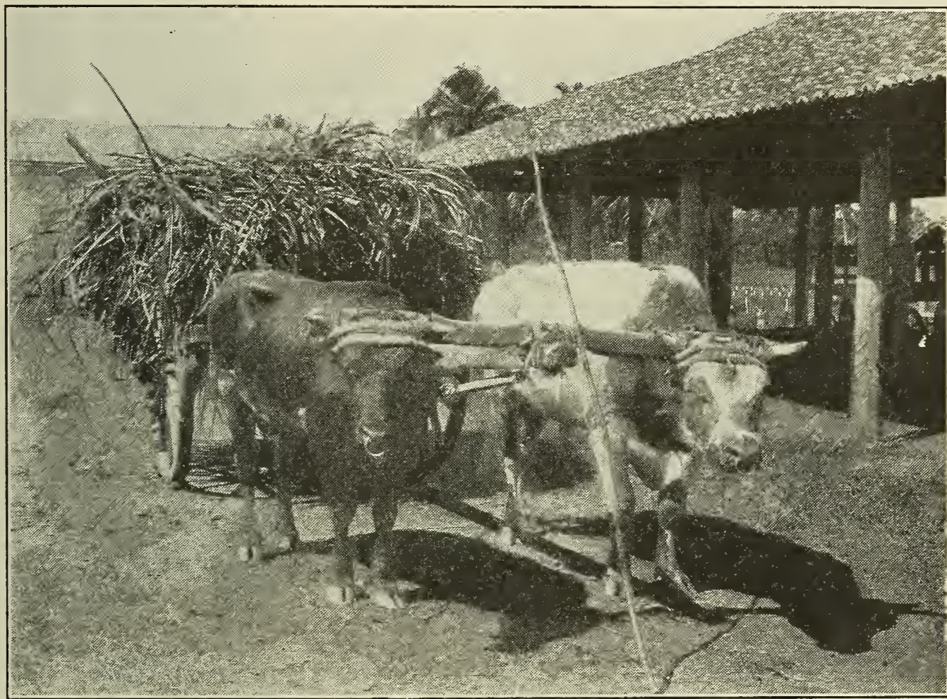
FIGURE 1.—Shorthorn bulls at the yoke

The station has been engaged in importing and breeding cattle in Porto Rico for 25 years. The results of some of the experiments have been of value in present practice and will serve as guides for the future. In 1904 the station brought in three males and one female, all Herefords, in the hope of making crosses for the improvement of the cattle for use as work and beef animals, as is done on the western ranges in the States. These cattle did not thrive as did the native animals. The hot sun and the cattle tick militated against their acclimatization. The station then imported from Texas four Zebu grade bulls the sires of which were purebred Zebus, and the dams showed some Hereford and Shorthorn blood. The animals