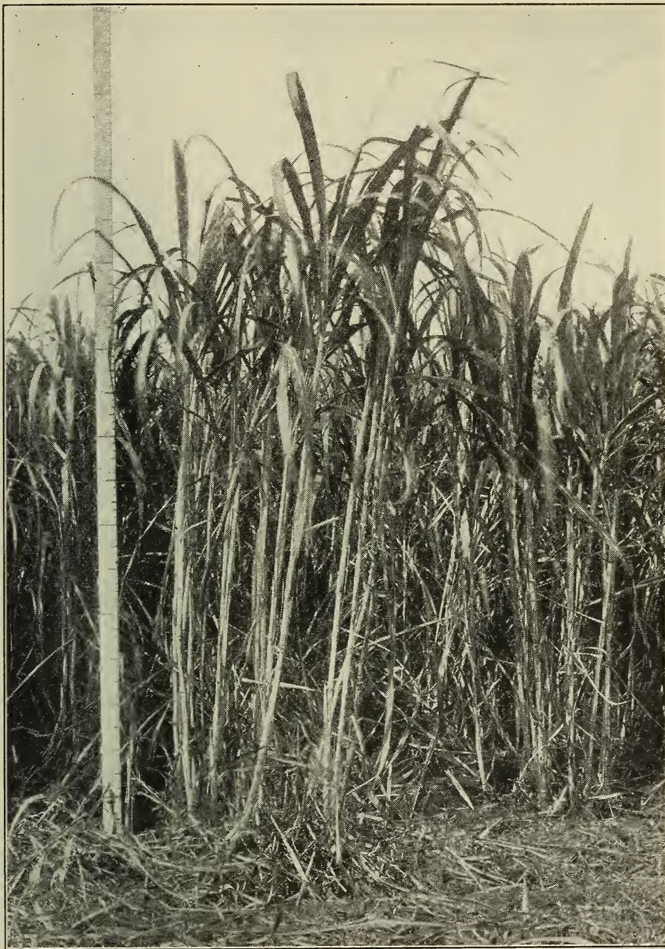
FIGURE 3.—Uba cane; fifth ratoon

In a country of equable temperatures and no frost, where the rainfall is abundant or irrigation is possible, conditions apparently should be ideal for growing vegetables throughout the year. In the