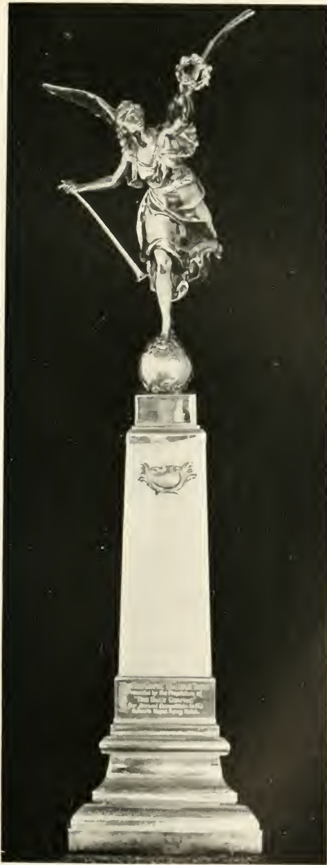
THE SCHOOLS RAPID FIRING TROPHY.