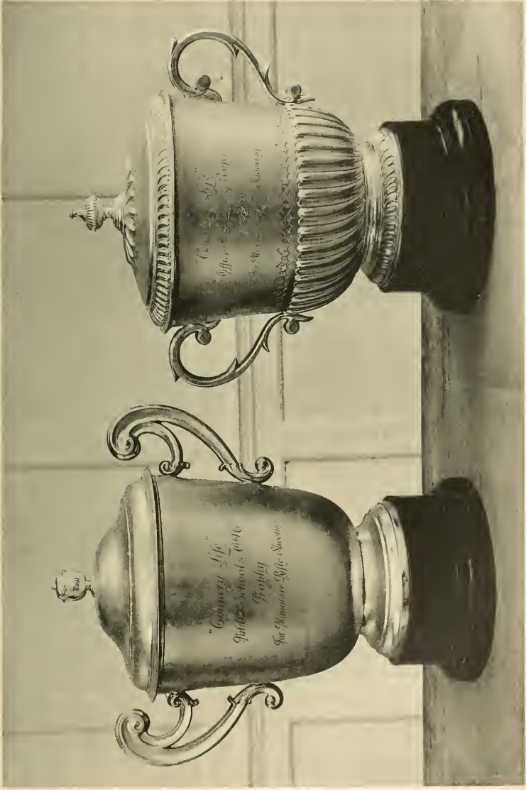
THE "COUNTRY LIFE" PUBLIC SCHOOLS O.T.C. TROPHY.