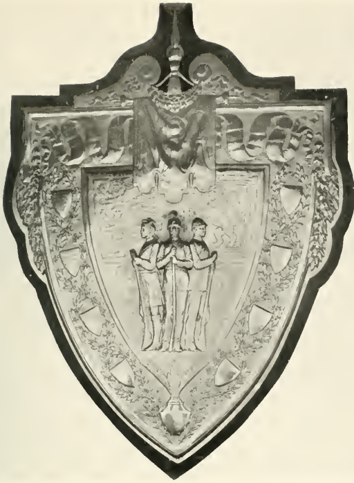
THE CAETS' CHALLENGE TROPHY.