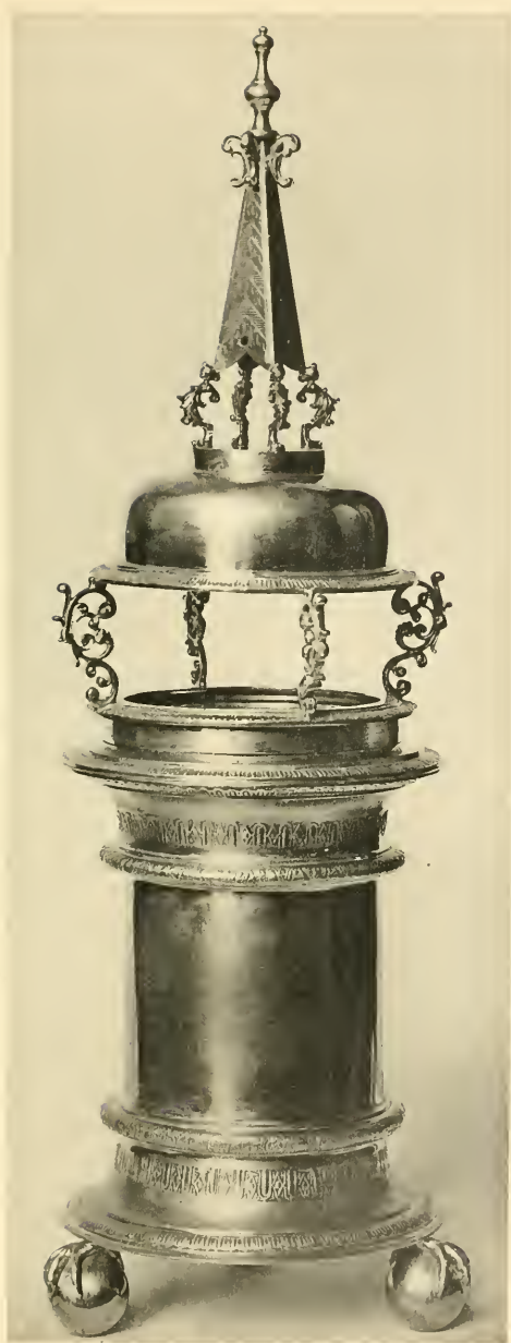
THE "COUNTRY LIFE" CHALLENGE TROPHY.

This takes the form of replicas of a pair of Elizabethan Steeple Salts, given in 1914 by "Country Life" to be shot for at 600yds. range.