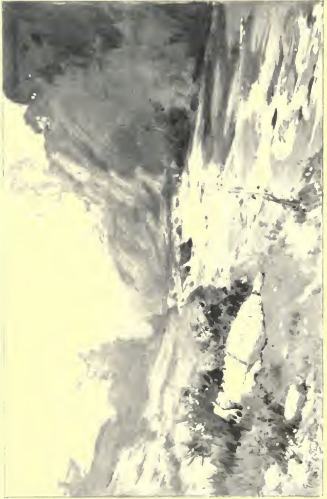
THE WHIPIH ON THE SUNNY BANK.