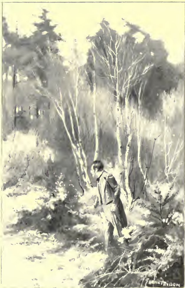
"YOU FIND THE FIRST PRIMROSE OF THE YEAR."