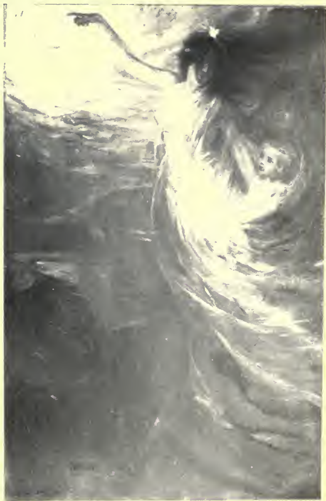
THE BIRTH OF SHAKSPERE.