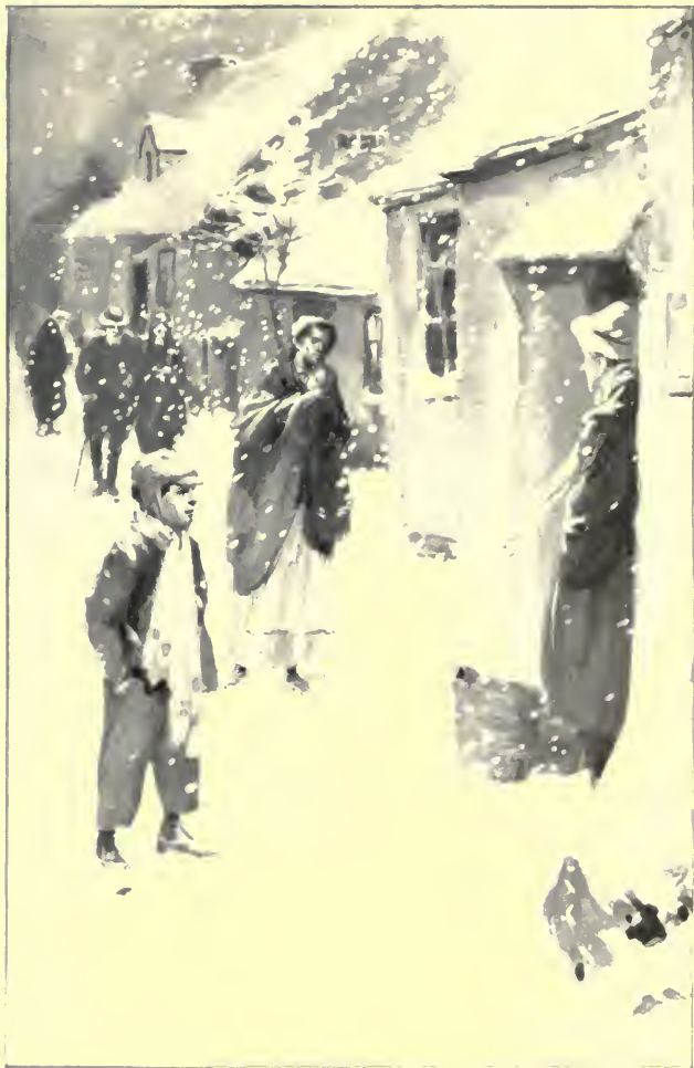
"ON A STORMY XMAS EVE."