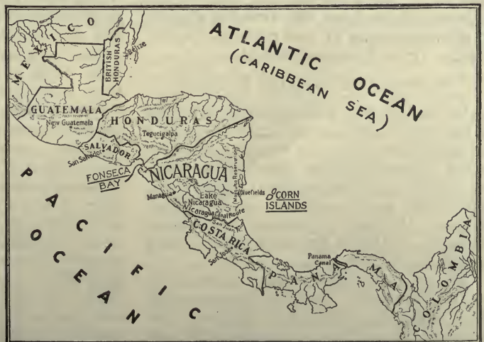
THE REPUBLIC OF NICARAGUA IN ITS RELATION TO OTHER CENTRAL AMERICAN COUNTRIES

The five republics of Central America, of which Nicaragua is one, have been the scene of probably more revolutions in the past hundred years than any other region of equal area in the world. If the Central American countries alone were to be considered, one might indeed keep "hands off," and let them "stew in their own juice."