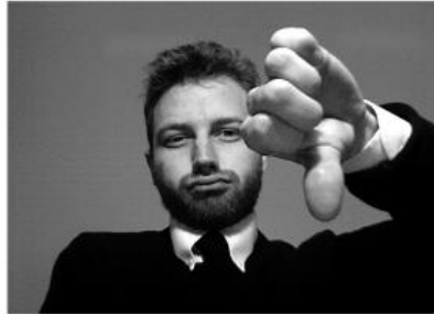
Vues à l'heure