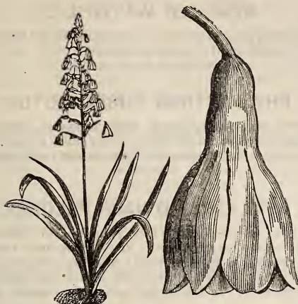
HYACINTHUS CANDICANS. (See page 8.)