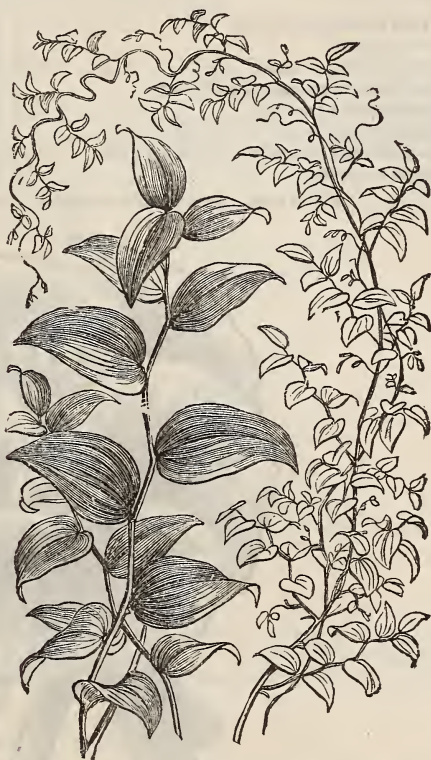
MYRSIPHYLLUM, OR SMILAX. (See p. 32.)