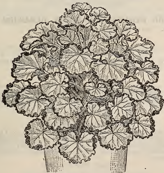
GERANIUM, FREAK OF NATURE.

A most brilliant and well-marked variety, very dark zone and intense yellow edge. 40c. each; $4.00 per dozen.