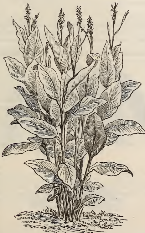
CANNAS. (See page 18.)

25c. each; $2.50 per doz., except where noted.