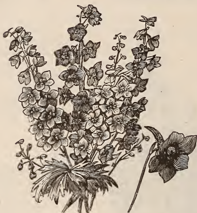
DELPHINIUMS. (See page 6.)