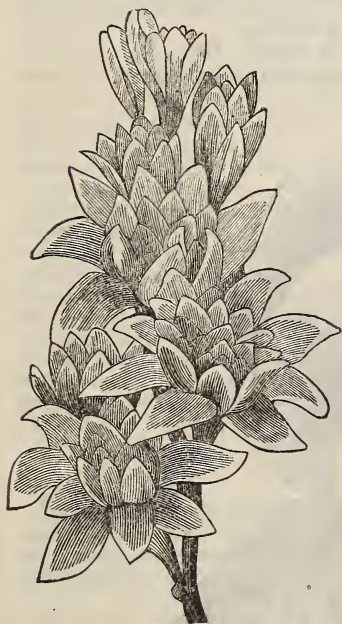
PEARL TUBEROSE. (See p. 40.)