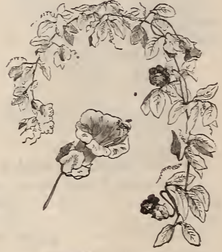
COBÆA. (See p. 21.)