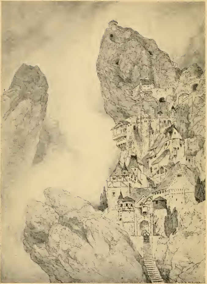
ONE HOUSE ON THE PINNACLE LOOKING OVER THE EDGE OF THE WORLD