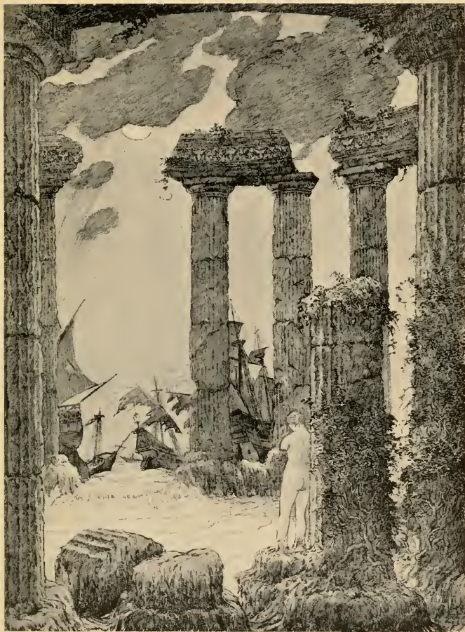
MIDNIGHT AND MOONLIGHT AND THE TEMPLE IN THE SEA