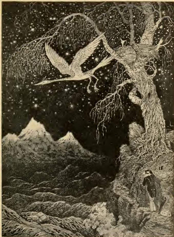
THERE STOOD THAT LONELY, GNARLED AND DECIDUOUS TREE