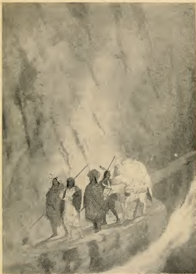
THEY HAD GONE THREE DAYS ALONG THAT NARROW LEDGE