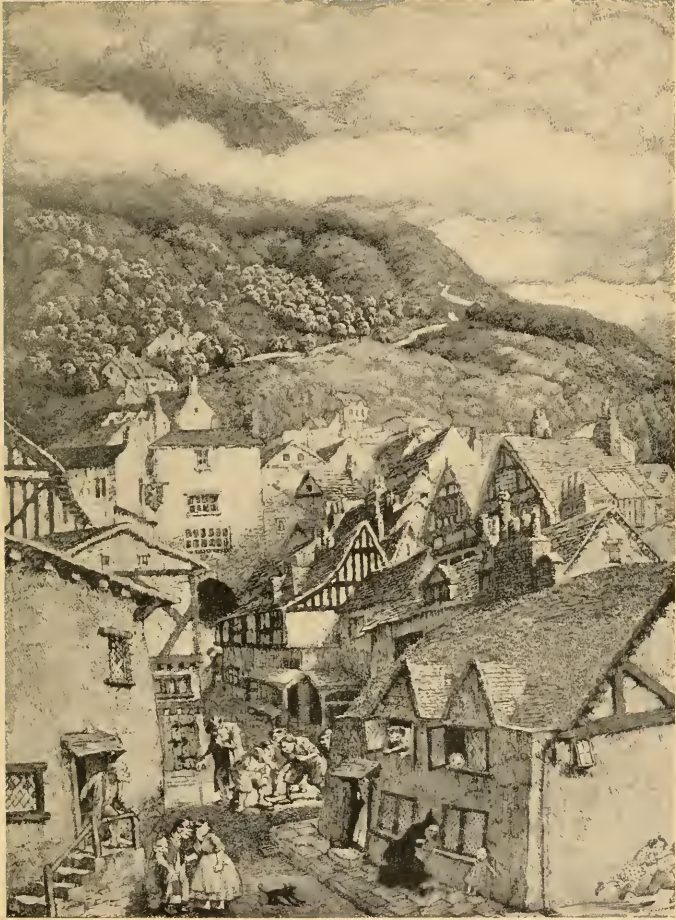
THE BAD OLD WOMAN IN BLACK RAN DOWN THE STREET OF THE OX-BUTCHERS