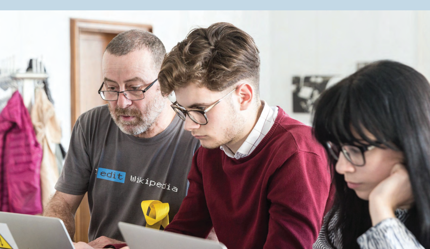
Author: Štěpán Pech, Editor: Shared Cities - Creative Momenta, 11 24.jpg, CC BY-SA 4.0