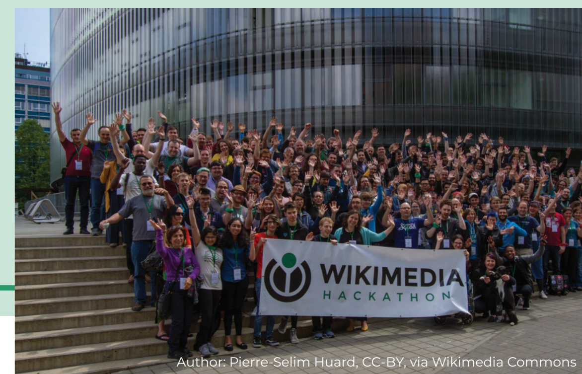
Author: Pierre-Salim Huard, CC BY, via Wikimedia Commons