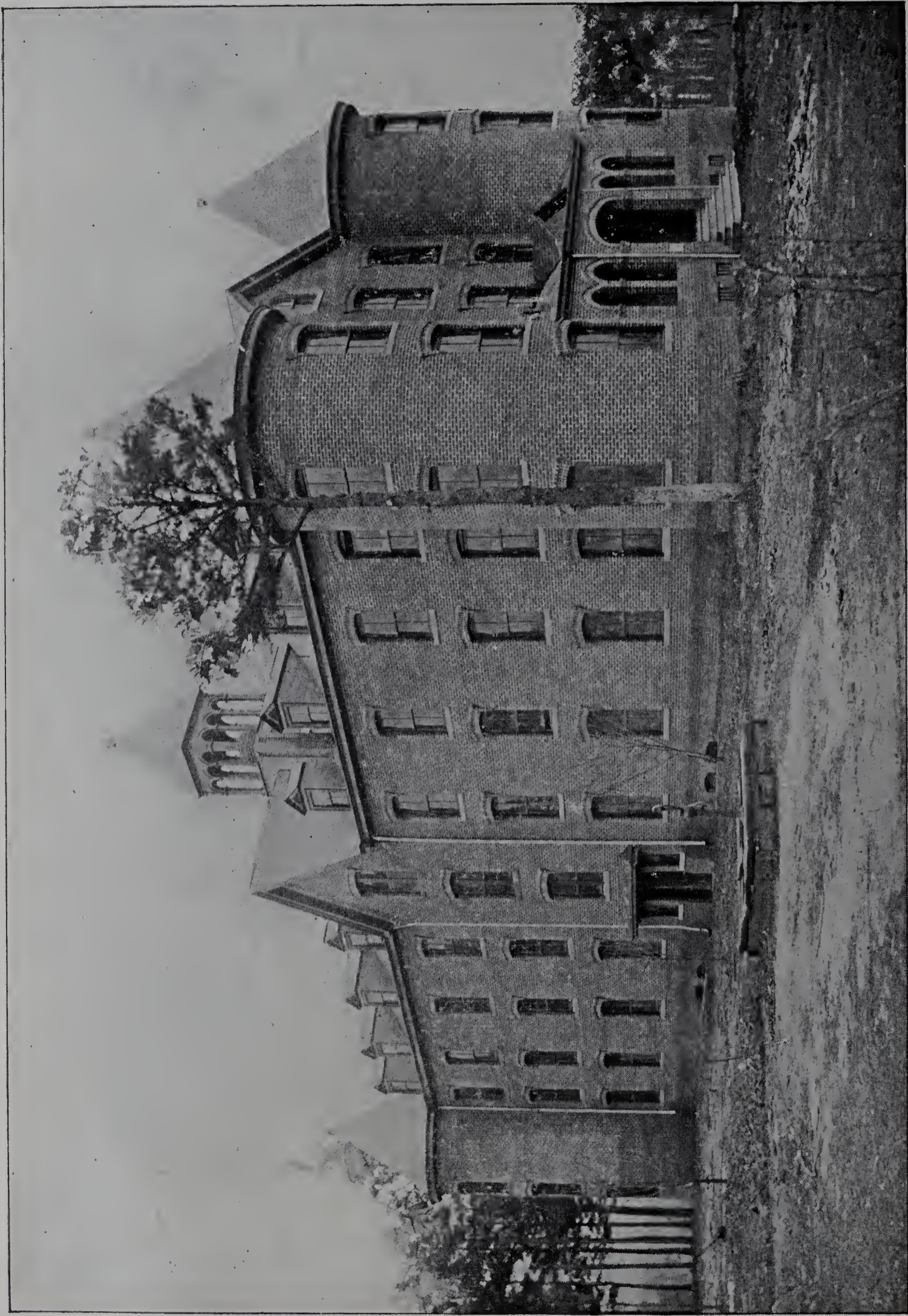
BIDDLE UNIVERSITY--CARTER HALL.