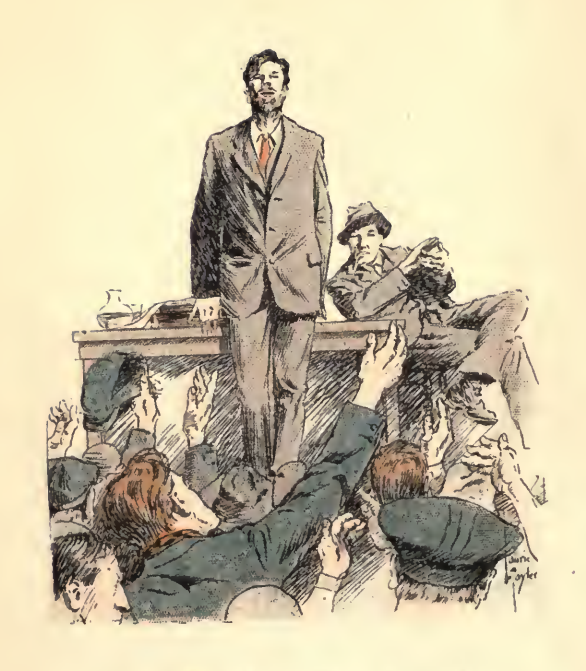
"And I take you all to witness . . . that I'll work on as long as I have life."