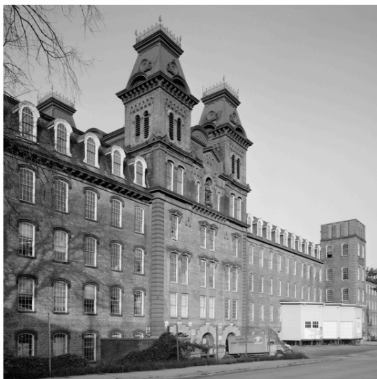
(1969, Public Domain, link )