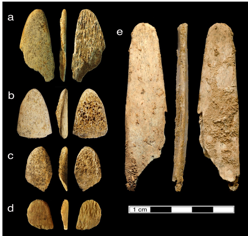
Figure 1. Photographs of the (a) Pech-de-l'Azé I (PA I) and (b–e) Abri Peyrony (AP) lissoirs . (a) PA I G8-1417. (b) AP-4209. (c) AP-4493. (d) AP-10818, newly published here. (e) AP-7839. Adapted/modified from 4 .