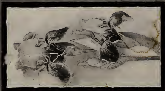
IRIS - KOENIG