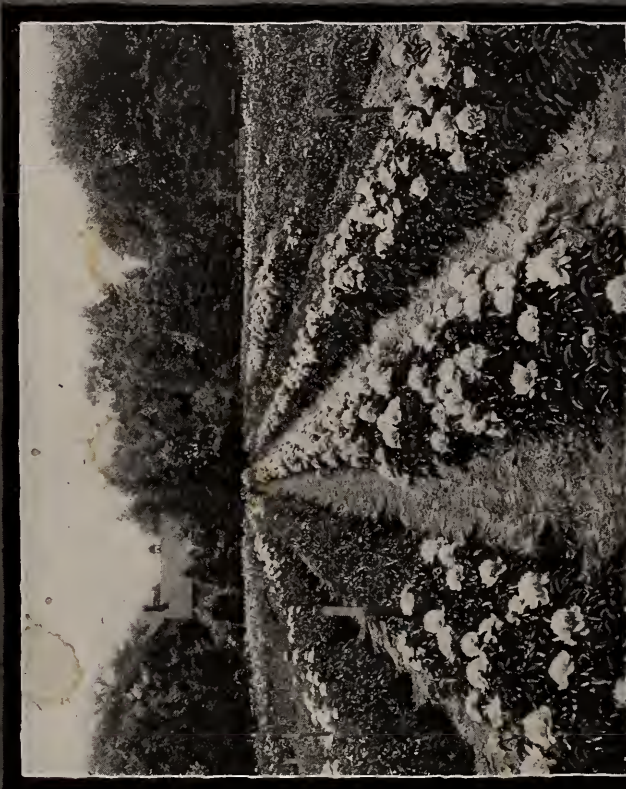
A BLOCK OF PEONIES IN OUR NURSERY