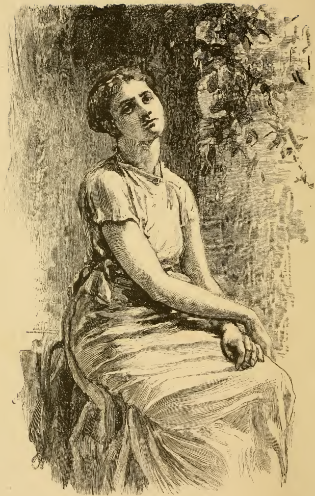
JESSAMINE. See p. 74.