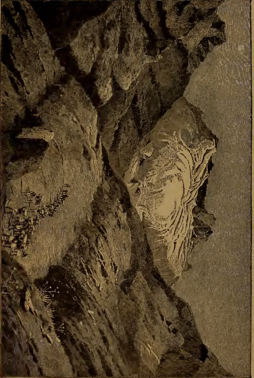
RUWENZORI.—“MOUNTAINS OF THE MOON.”—NORTH-WEST PEAK, SHOWING POINT REACHED BY LEUT. STAIRS, AND WHAT APPEARS TO BE THE CRATER OF A PEAK.