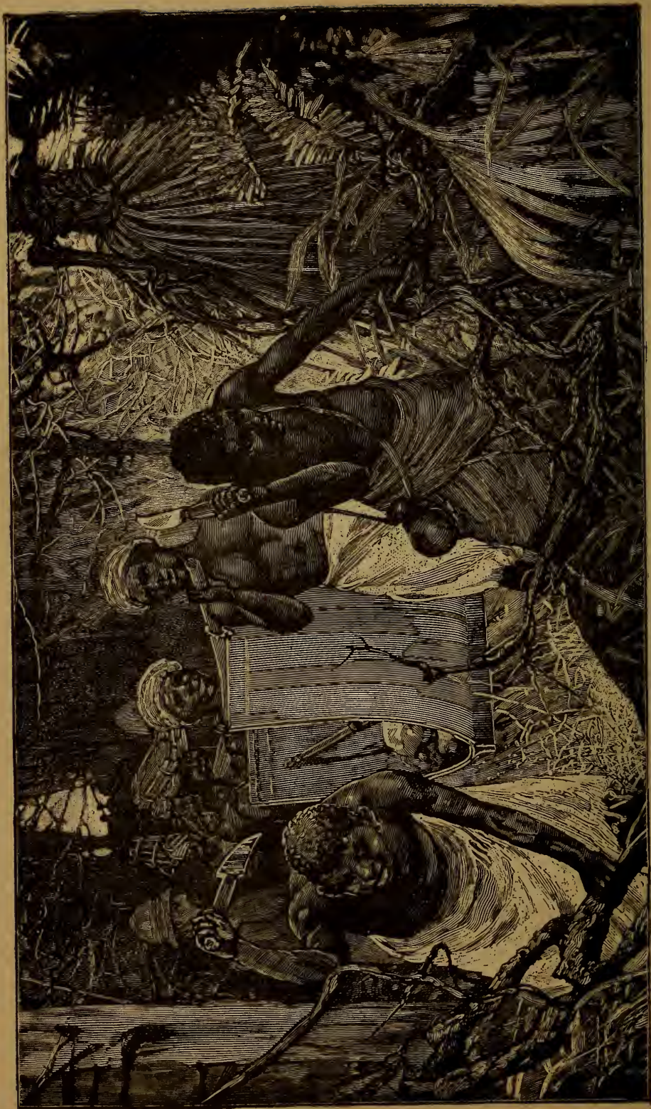
CARRYING THE STEEL BOAT AND CUTTING A PATH THROUGH THE FOREST