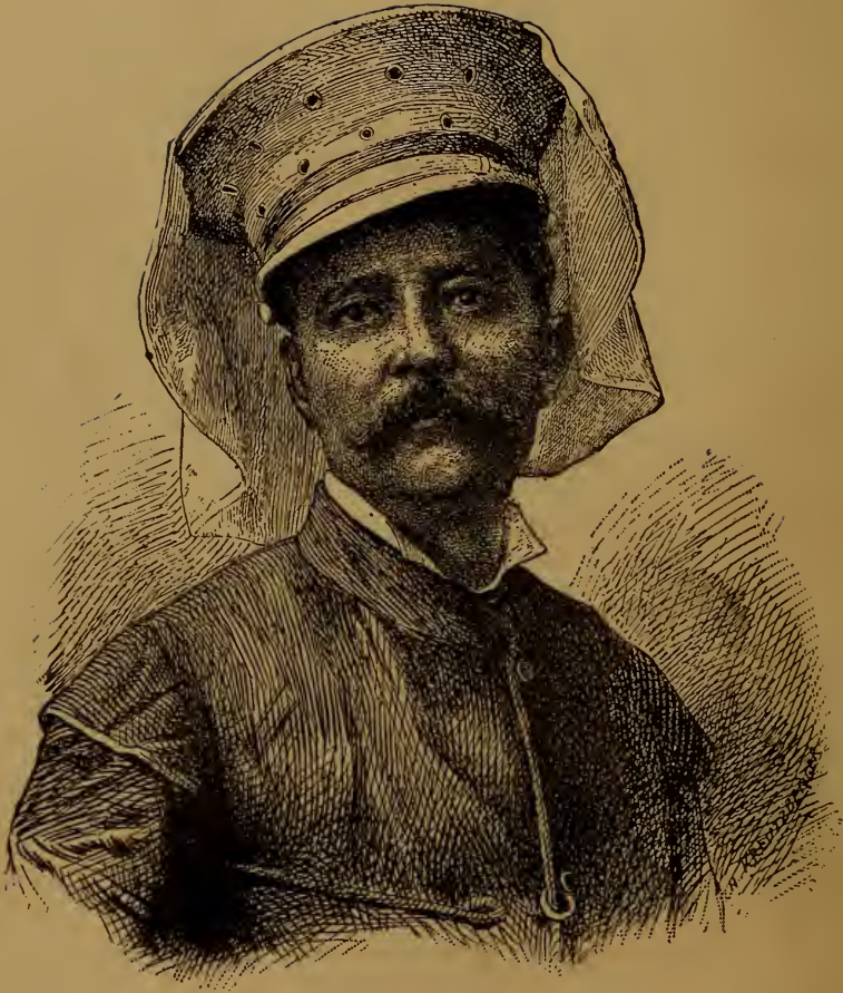
HENRY M. STANLEY.