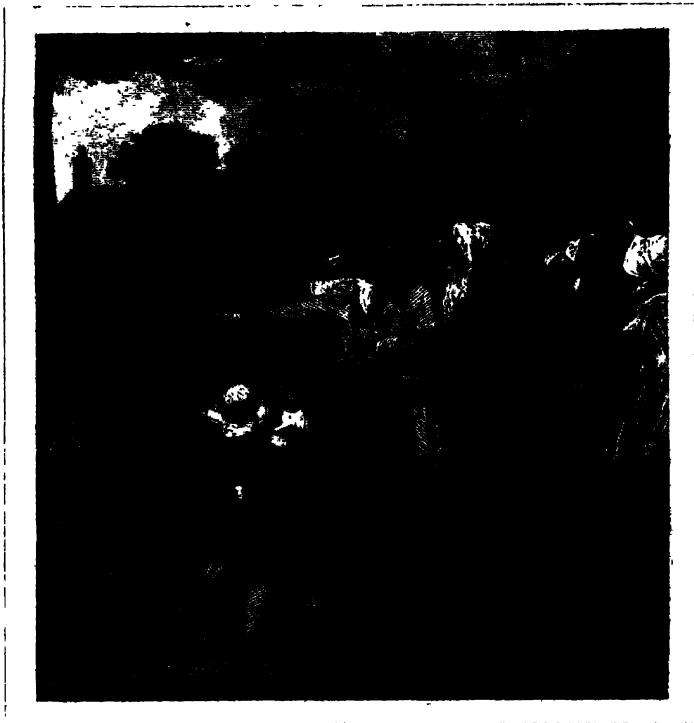
Drawn by R. Westall R.A.