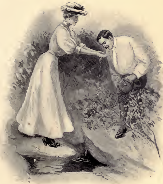
"MAKING A CUP OF HER WHITE HANDS."