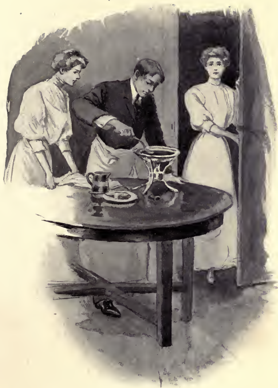
"HE WAS BENDING ANXIOUSLY OVER A BUBBLING SAUCEPAN."