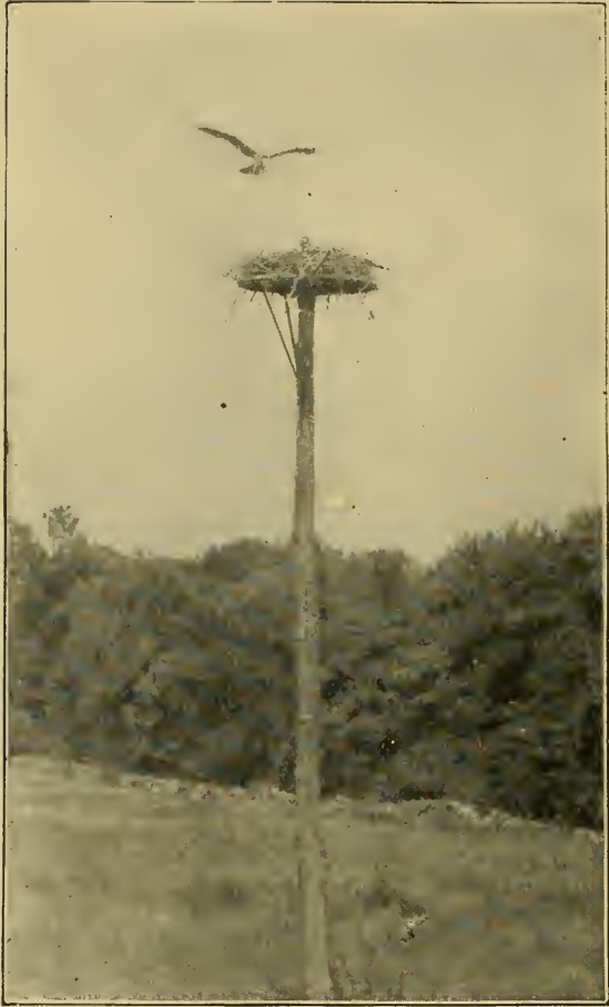
AN OSPREY'S NEST.