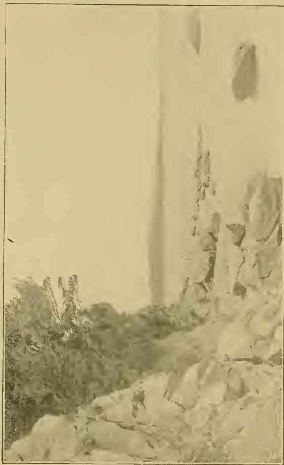
MOUNT HOPE ON NARRAGANSETT BAY.