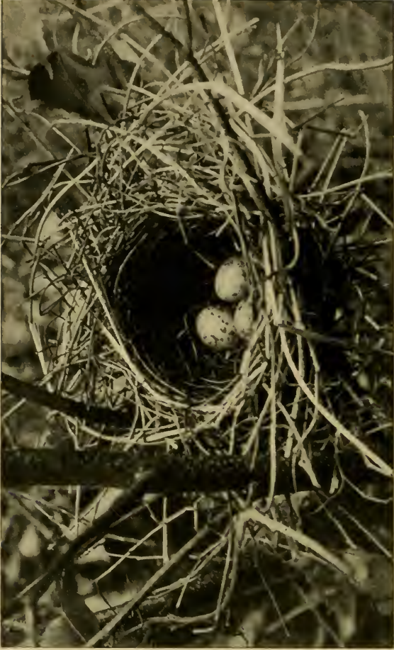
ROSE-BREADED GROSBEEK'S NEST.