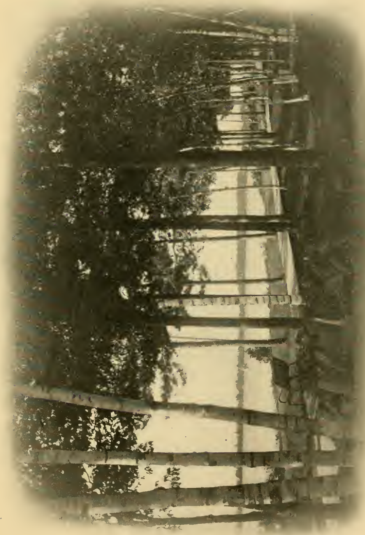
THE BIRCHES AT WE-QUE-TON-SING.