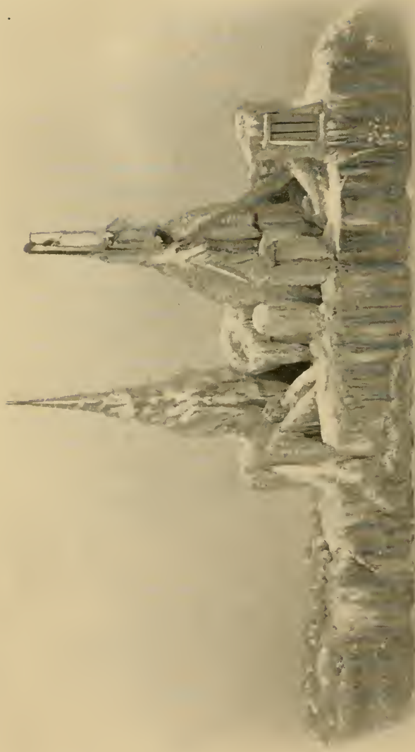
A NATURAL FORMATION OF ICE ON THE BREAKWATER AT PETOSKEY JAN. 1902.