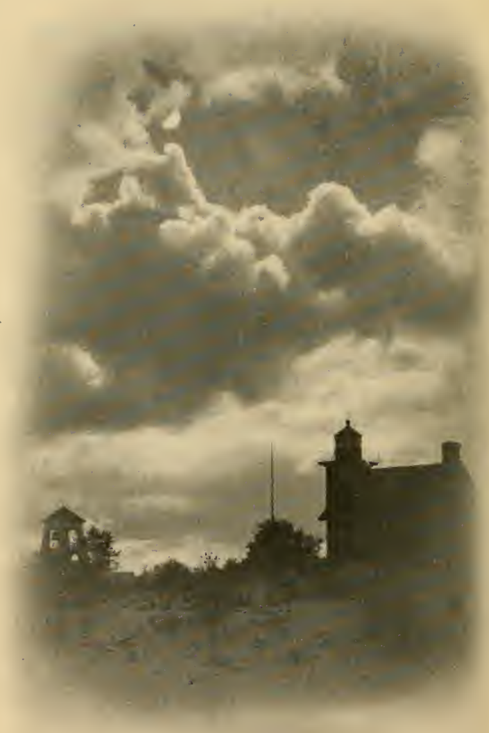
HARBOR POINT LIGHT HOUSE.