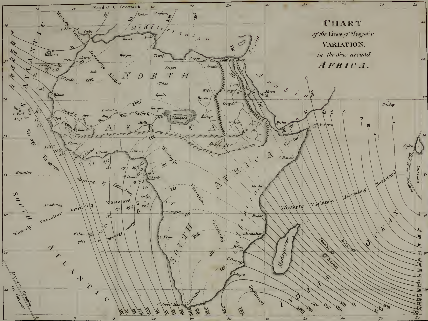
CHART of the Lines of Magnetic VARIATION, in the Seas around AFRICA.