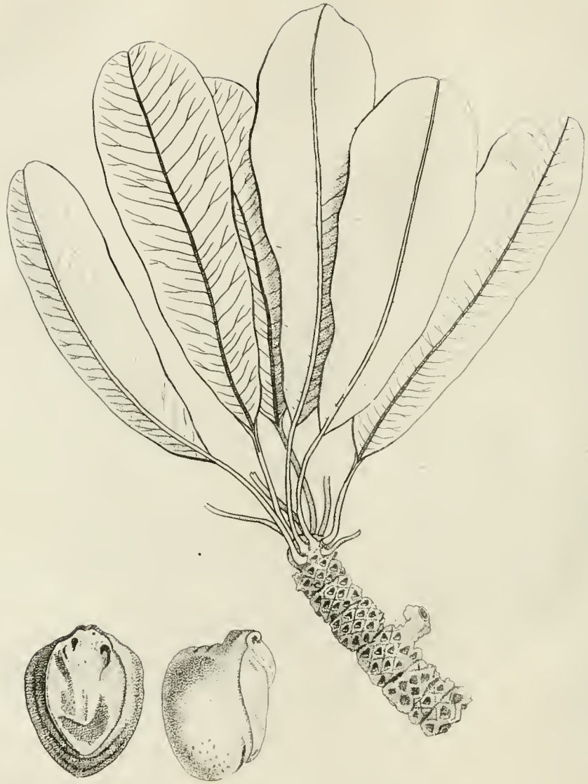
Shea or the Butter Tree.