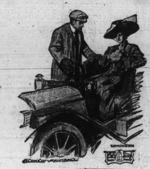
The made-to-order Man Wants Good Suits.

The ancient ceremony of proclaiming the fair at Market Drayton, Eng., was observed recently. Clad in scarlet robes the bailiff of the old manor, accompanied by the court leet officials, proceeded through the town and wanged all thieves, cut-purses and disorderly persons to devast.