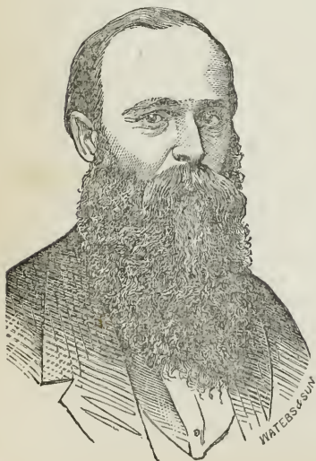
FIG. III.—Page 136.