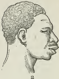
FIG. II.—Page 136.