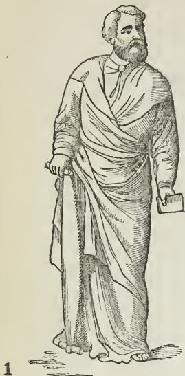
FIG. I.—Page 135.