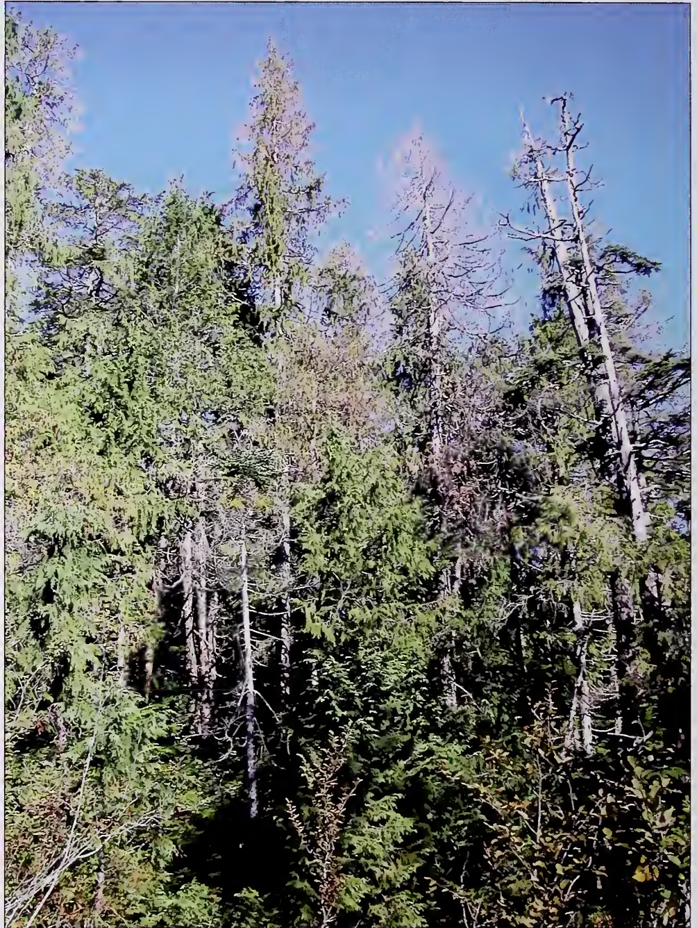
Figure 7—Crow Lagoon. Several dead and dying overstory trees, as well as smaller surviving yellow-cedar trees. Nearly all of the dead and dying trees encountered during this brief ground survey were yellow-cedar. Western redcedar contributed a small percentage of the stand and was not dying in high numbers. Necrotic lesions in the cambium extending up from the root collar, a symptom of yellow-cedar decline, were found on several dying yellow-cedar trees here.