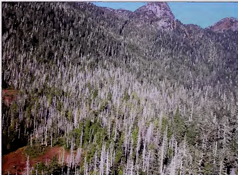
Figure 10—Worsfold Bay. Concentrated yellow-cedar mortality adjacent to a sloping bog in a cirque basin at 250 m elevation near Worsfold Bay. The appearance of large dead yellow-cedar trees with intact tops allows for simple detection of yellow-cedar decline.