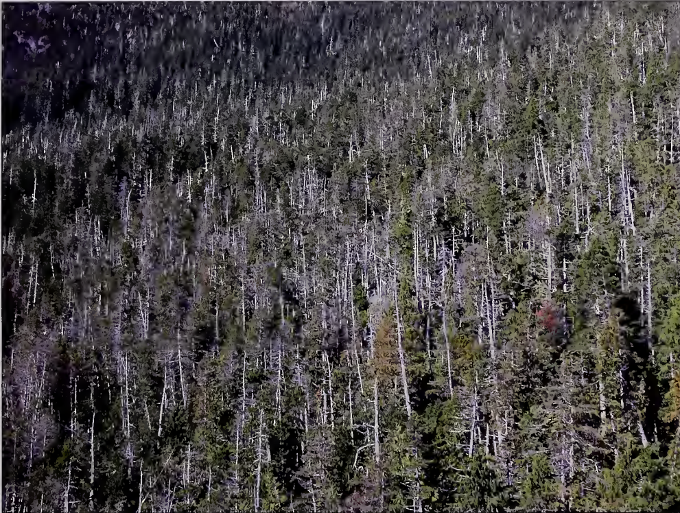
Figure 8—Union Inlet. Extensive, more diffuse yellow-cedar decline on a concave hillslope at approximately 300 m elevation that covered hundreds of hectares (much of the area beyond the photograph).