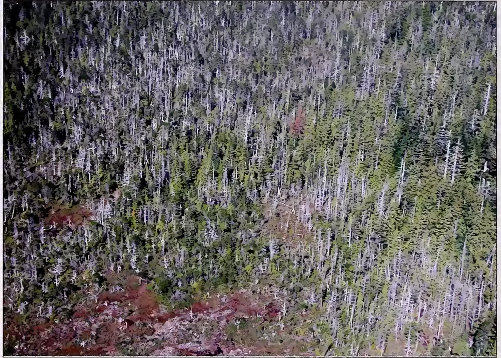
Figure 14—Cypress Lake, Banks Island. Dead trees associated with the edges of a bog depression. We observed large areas of mortality in a mosaic of scattered dead trees and higher concentrations from Donaldson Lake to north of Cypress Lake at various elevations and aspects. The more concentrated mortality had large dead trees and occurred on steeper slopes with greater forest productivity. We landed on a boggy hillside north of Cypress Lake at about 300 m elevation. Here, we found new and old snags, nearly all yellow-cedar. Most of the western redcedar was live, although some had spike tops. All trees were relatively small at this wet site.