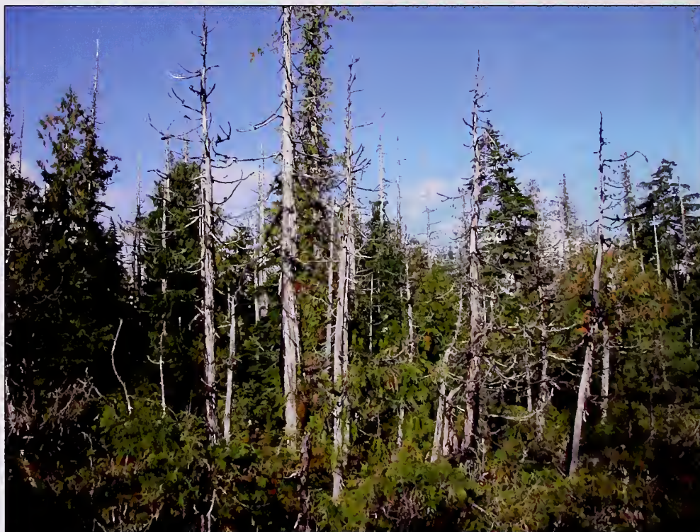
Figure 4—Diana Lake. Small patch of dead trees of both cedar species at a low-elevation bog woodland–bog forest complex. Generally, yellow-cedar occurs only as a minor component in low-elevation forests in areas such as Diana Lake. Large concentrations of dead trees were not found at this site.

Several other locations of dead trees were detected but photographs are not included in this report. Mortality was observed in a wet forested bog complex near Tuck Inlet. Scattered dead trees were noted at low elevation on the east side of Kennedy Island. At Captain Cove, relatively low concentrations of dead trees were observed on a hillside with south aspect at about 300 m. Two large bowls nearby at about 400 m elevation contained new and old yellow-cedar snags. One small patch with a concentration of dead cedars was observed on an exposed ridge. Concentrated mortality was detected on the north side of Holmes Lake on Pitt Island at about 350 m elevation, some of which was on steep terrain. A very large area of scattered snags could be seen extending at lower elevations along Petrel Channel on Pitt Island from Holmes Lake to Hevenor Inlet.