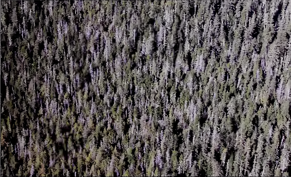
Figure 5—Scattered dead and dead-topped trees in a mixed western redcedar–yellow-cedar–western hemlock forested landscape at low elevation near Prince Rupert. Location is not shown on the map in figure 3. The abundance of spike-top, partially dead western redcedar confounds the identification of yellow-cedar decline in these mixed-cedar forests. The wood of both yellow-cedar and western redcedar is resistant to decay, and the slow deterioration of both tree species often leaves tree tops intact long after death. Thus, ground surveys would probably be needed to determine the live and dead populations of each species before judging whether forests such as this have a yellow-cedar decline problem.