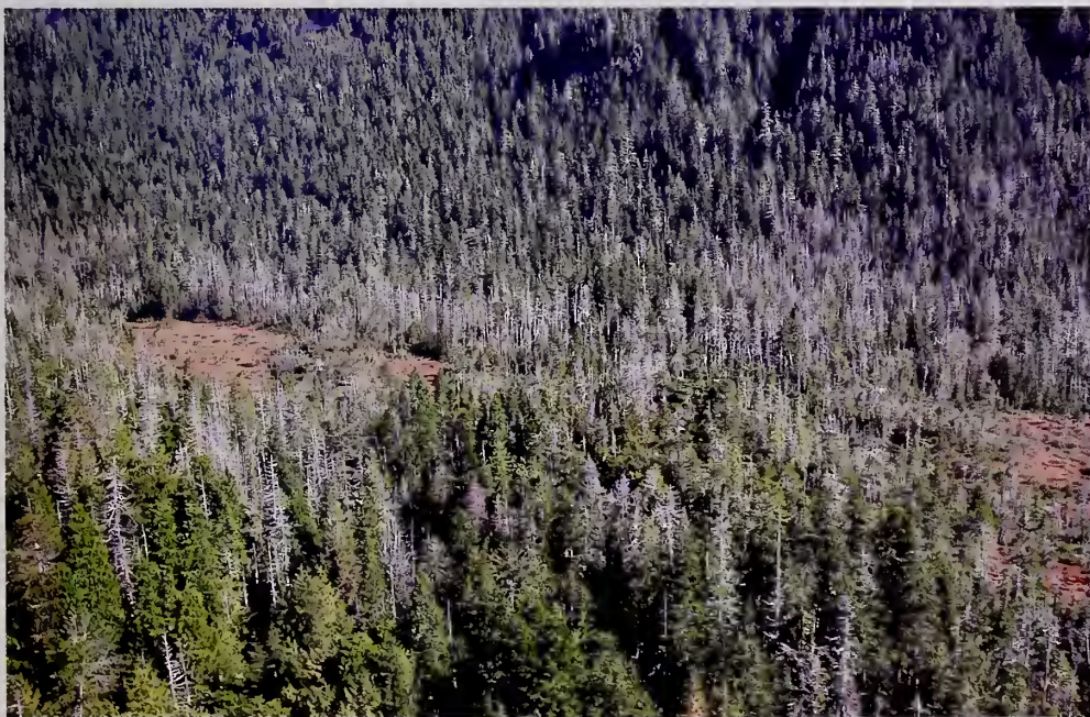
Figure 9—Union Inlet. A high concentration of dead yellow-cedar trees on gentle terrain surrounding bogs.