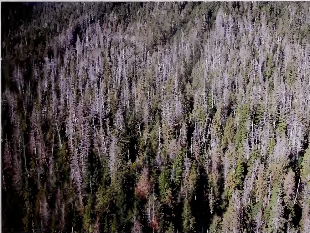
Figure 13—A closer view of the patch of yellow-cedar decline near Hayward Creek. Note the dying orange-crowned yellow-cedar trees interspersed with the dead yellow-cedar snags. This illustrates the progressive intensification of this forest decline.