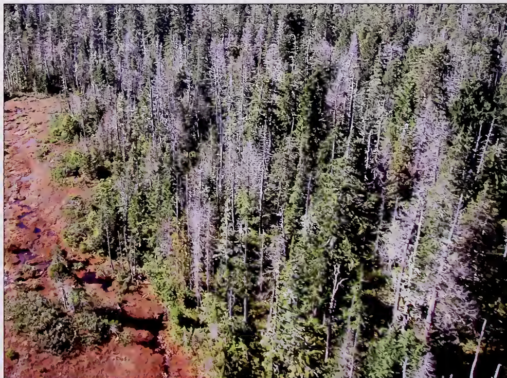
Figure 11—Worsfold Bay. Concentrated yellow-cedar mortality adjacent to a bog. The fine branches on some dead trees in the foreground indicate recent tree death.