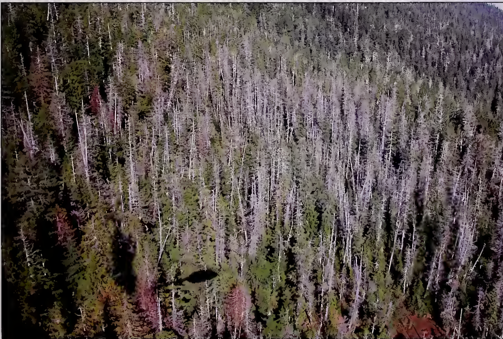
Figure 6—Crow Lagoon. This dense patch of snags illustrates the typical appearance of yellow-cedar decline: a mixture of older mortality, recently killed trees, and some dying trees. An estimated 70 to 80 percent of the overstory yellow-cedar trees was dead in this stand. This declining yellow-cedar forest was located above an open sloping bog on an east-southeast aspect at about 300 m elevation.