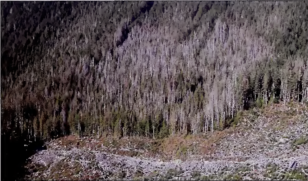
Figure 12—A concentrated patch of large yellow-cedar snags at about 300 m on a hillside above a cutting unit near Hayward Creek. Another patch of dead yellow-cedar (not shown) was found nearby at about 400 m elevation.