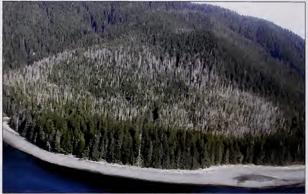
Figure 1—A large patch of yellow-cedar in decline near sea level close to the northern limits of the decline on Chichagof Island, Alaska.

years ago (Hennon and Shaw 1997). Following death, slow deterioration owing to yellow-cedar's unique heartwood chemistry (Barton 1976) allows snags to remain standing for up to a century. As these standing dead trees accumulate, 70 percent or more of yellow-cedar basal area is typically found dead in these forests. Thus, where mortality is this intensive, the problem is not difficult to detect by reconnaissance flights or other types of remote sensing.