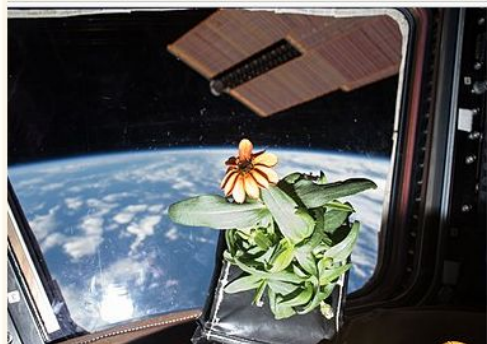
Zinnia flower in space

Plants in space are plants grown in outer space typically in a weightless but pressurized controlled environment in specific space gardens. [1] In the context of human spaceflight, they can be consumed