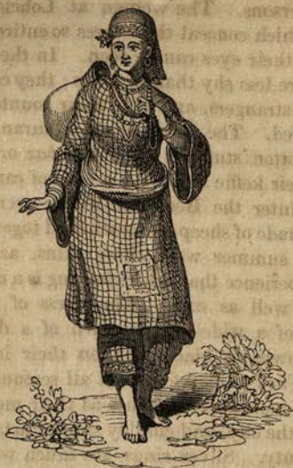
A young Female of the Coffee Mountains.

The face is concealed with a white or light-blue piece of cloth called borko , in which there are two holes worked for the eyes, but so large that nearly the entire features may be seen. This piece of female vanity, according to Ali Bey, had better be spared, as the illusion of hidden charms is completely dispelled when a sight is obtained of their lemon-coloured complexions, their hollow cheeks daubed all over with black or greenish-blue paint, their yellow teeth, and their lips stained of a reddish tile-colour. Though custom has reconciled them to these artificial means of heightening their beauty, their appearance is frightful and repulsive to strangers. It ought to be added, however, that in general they have fine eyes, regular noses, and hand-