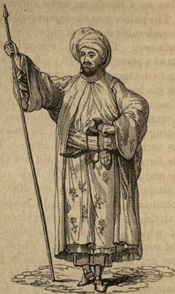
An Arab of Rank in the Costume of Yemen.

with strait sleeves covered by a flowing gown. The turban is very large, falling down between the shoulders. The jambea , a sort of crooked cutlass or dagger, is inserted in a broad girdle, and to the handle is sometimes attached a kind of chaplet or rosary, which the Mohammedans use at prayers.