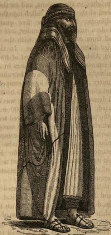
Abdallah ibn Saoud, Chief of the Wahabees.

dallah. But the Ottoman divan were implacable. Mercy is no attribute either of the religion or the policy of the Turks ; and, after being paraded over the city for three days, the unhappy chief, with his two companions in misfortune, his secretary and treasurer, were beheaded (December 19, 1818) in the public square of St Sophia. The pasha and his son