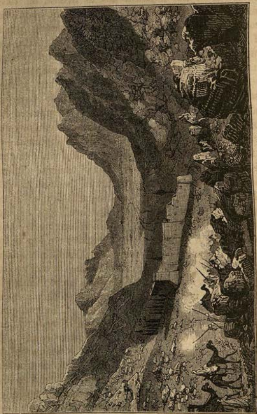
Convent of Saint Catherine, Mount Sinai.