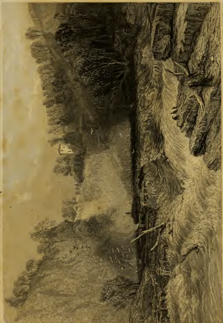
Scene by the Cammerloch