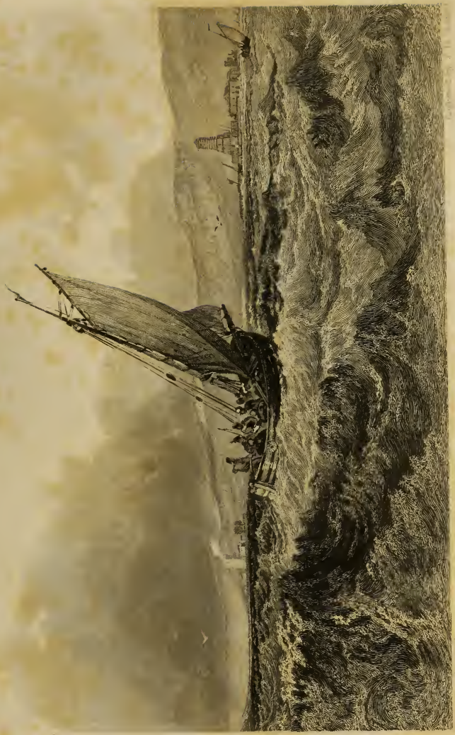
THE GREAT BRITAIN