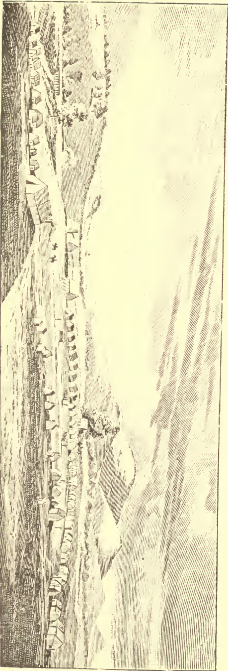
CAMP THLDEN, MITCHELL'S STATION, VA.