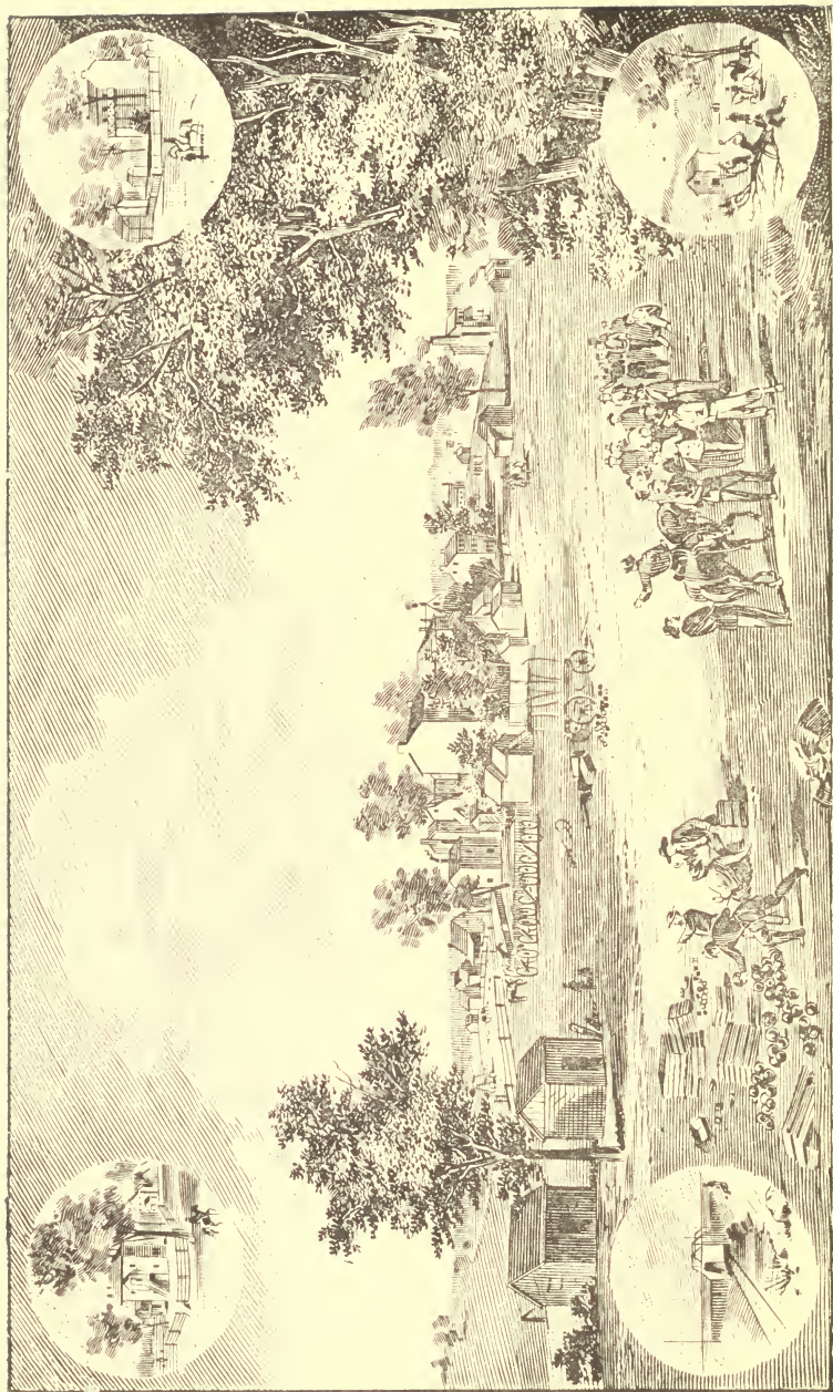
APPOMATTOX C. II., PLACE OF LEE'S SURRENDER.