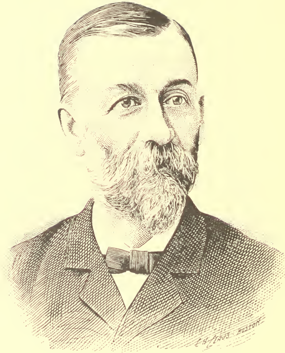
LIEUT. COLONEL AND BREVET COLONEL.