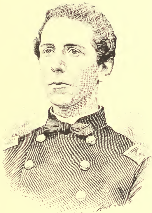
COLONEL, AND BREV. BRIGADIER-GENERAL.