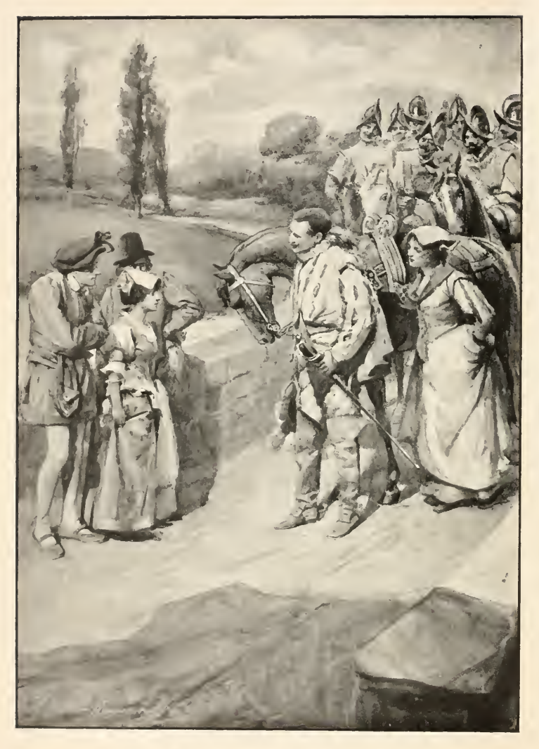
"HE HAD DISMOUNTED, AND HAD HIS HAT IN HIS HAND"