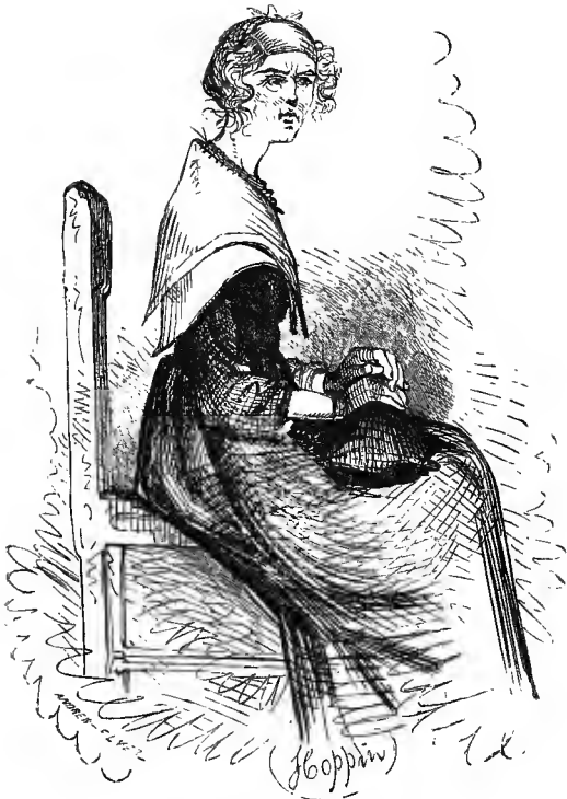
THE POOR RELATION.