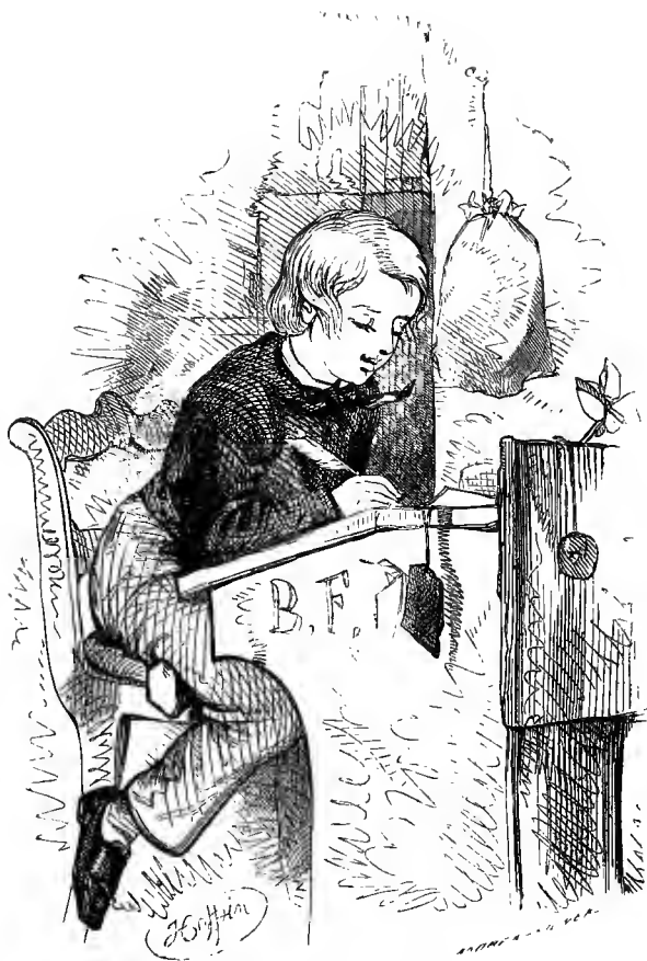
OUR BENJ. FRANKLIN.