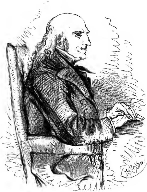
THE OLD GENTLEMAN OPPOSITE.