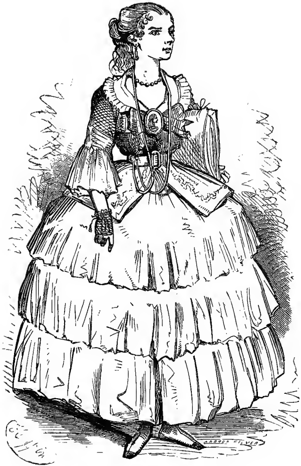
THE LANDLADY'S DAUGHTER.