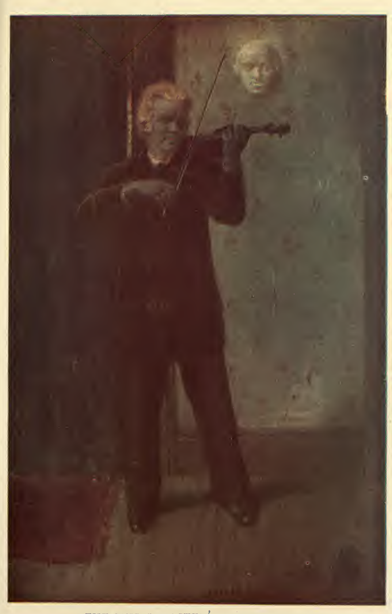
THE MUSIC MASTER'S CONFIDANTE