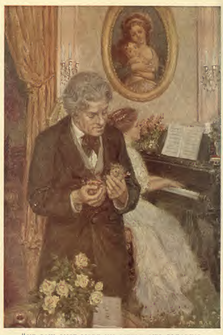
"HE SAW ONCE MORE HIS LITTLE GIRL PLEADING WITH HIM TO MEND THE DOLL WITH THE BROKEN EYE" (p. 275)