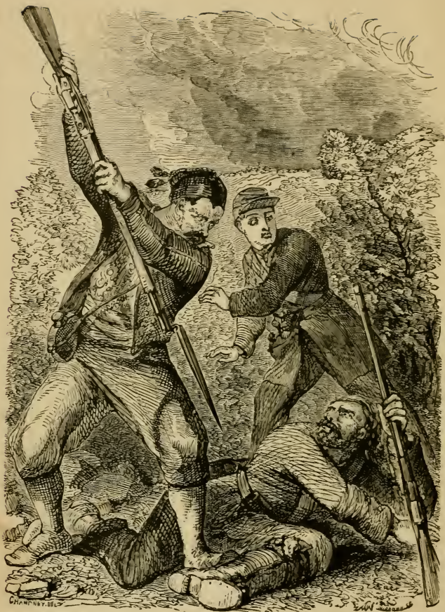
ON THE RETREAT FROM BULL RUN.— PAGE 138.