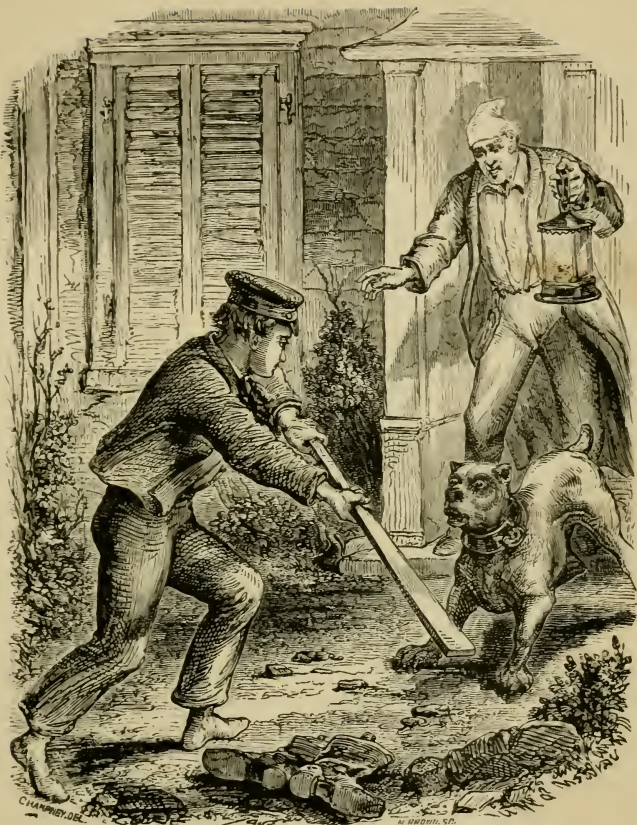
TOM'S BATTLE AT MIDNIGHT. — PAGE 75.