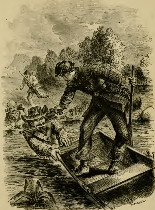
DOWN THE SHENANDOAH.—PAGE 230.