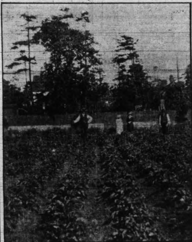
A Victoria Lot Producing Food for Family

204; Special, 13; Victoria West, 373. Total, 5,576, an increase of 381 over the enrollment of last year and of 52 of the enrollment last month.