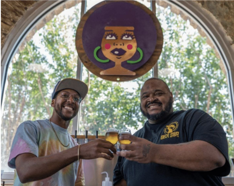
Vine Street Brewing's Mega Event Packs Star-