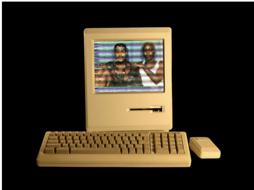
{B/qKC}: a digital archive