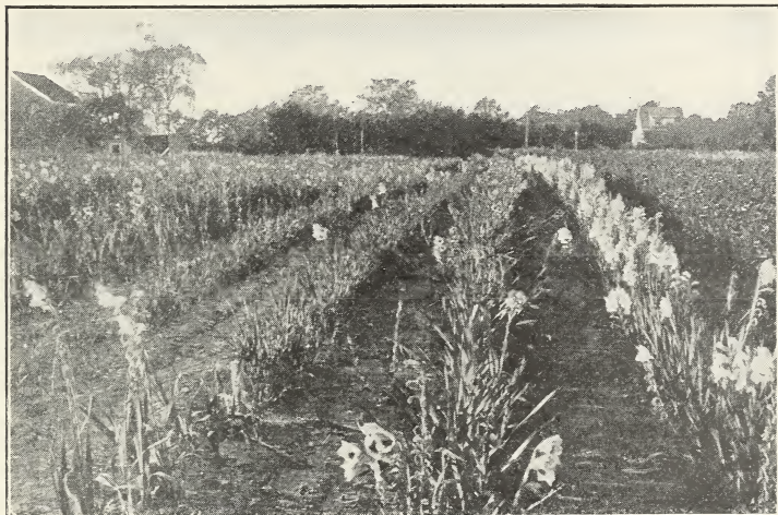
A SECTION OF OUR CUTTING FIELD FROM WHICH WE SUPPLY ALL OF BROCKTON'S LEADING FLORISTS

We will ship this collection, 25 varieties, $2.36 value, for $2.