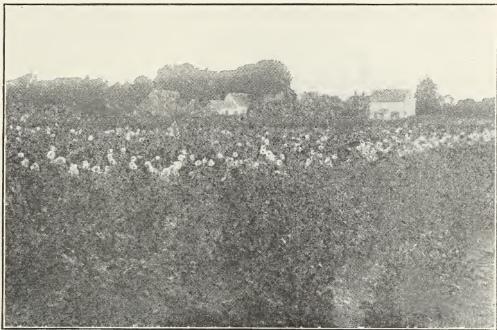
A FIELD OF DECORATIVE DAHLIAS

This collection of 19 varieties, value $8.65, for $7.00 Selected from the best standard varieties. All are good bloomers and will give the greatest satisfaction.