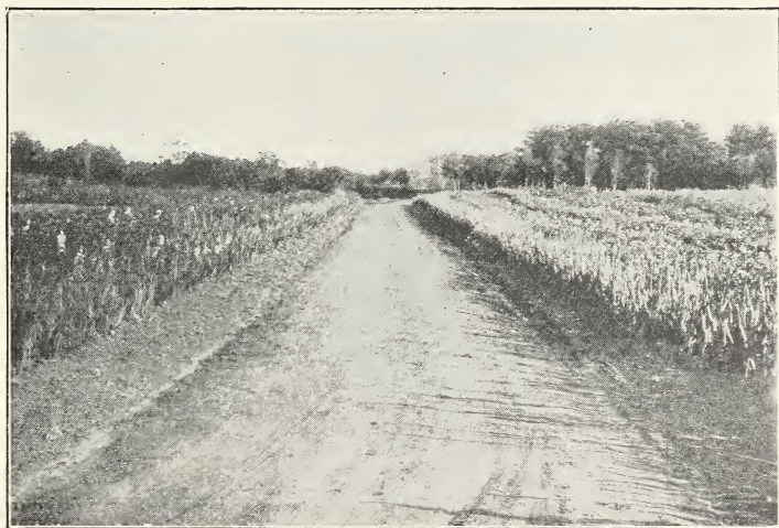
THE DRIVE THROUGH OUR GARDENS

Our mixture contains some of the finest varieties grown, also several new seedlings. We are making a very low price on them considering the quality and number of varieties. 15c each; 10 for $1.00 postpaid.