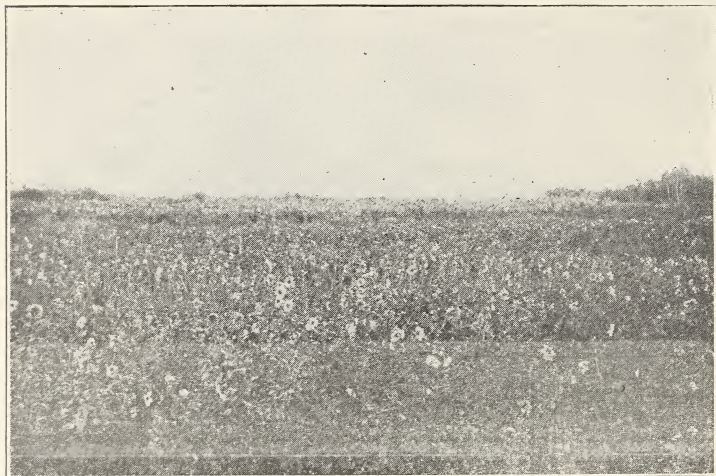
EXTENSIVE VIEW OF OUR GARDENS

Decorative. A superb, new variety that has made a place for itself in the cut flower market. Color rose-pink tipped white. Flowers large and held erect on long cane stiff stems. $2.00 each .