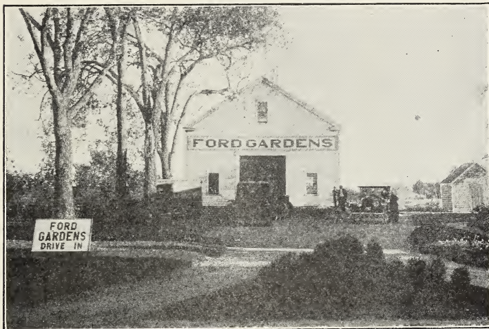
ENTRANCE TO FORD GARDENS