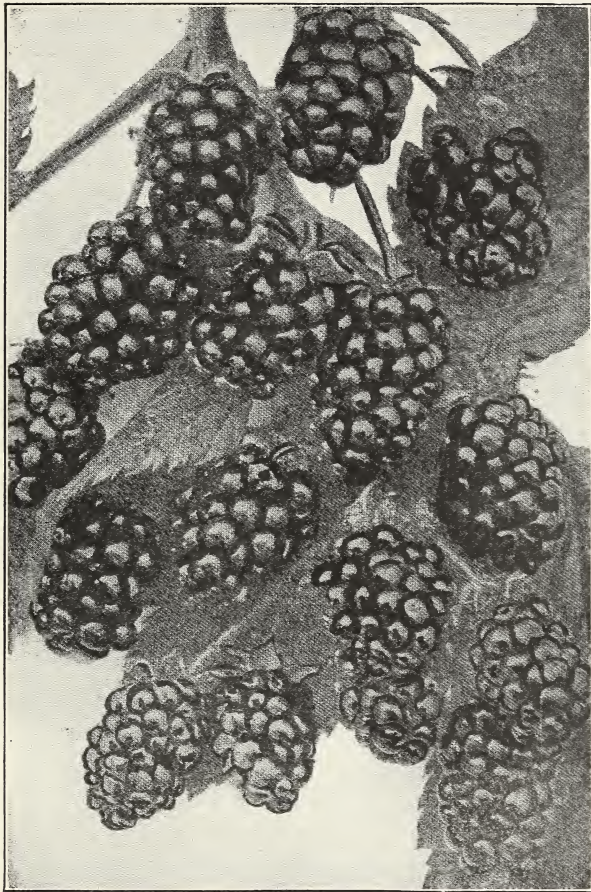
THE FORD BLACKBERRY