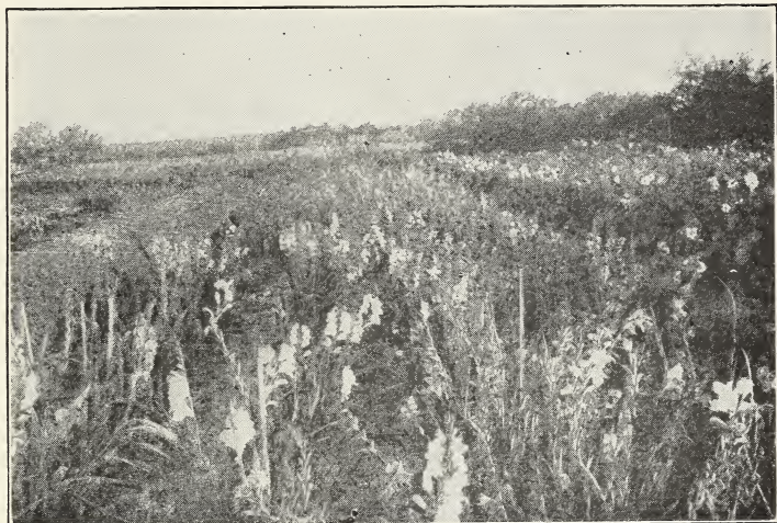
VIEW OF OUR EXPERIMENTAL GARDEN

of exquisite coloring, from the softest primrose to a beautiful rose. 5c each; 50c dozen; $3.50 hundred.