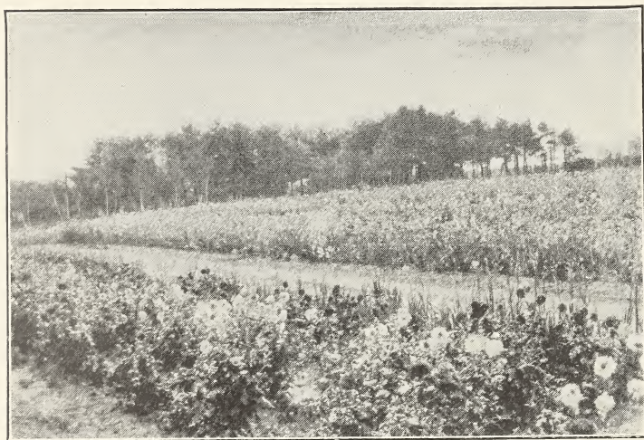
AN ATTRACTIVE CORNER OF OUR GARDENS GROVE IN BACKGROUND

As soon as dug in the field, cut the stalks about 2 or 4 inches from the crown. Pack in boxes or bins, with the crown down, to prevent the moisture in the stalk from working down into the tubers, as this will cause rot.