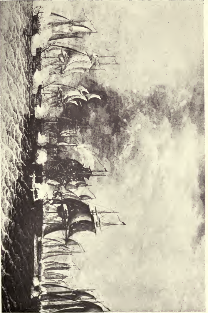
BATTLE OF LAKE ERIE, FROM A RARE ENGRAVING