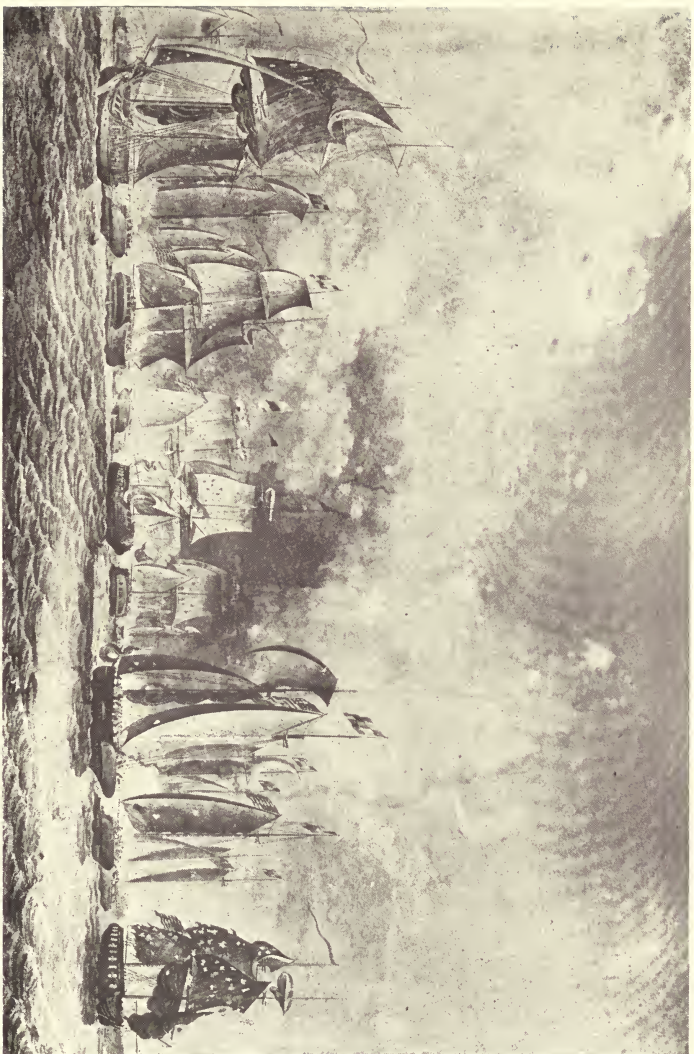
THE NIAGARA BREAKING THROUGH THE BRITISH LINE