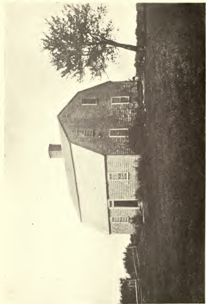
BIRTHPLACE OF COMMODORE PERRY, NEAR SOUTH KINGSTON, R. I.