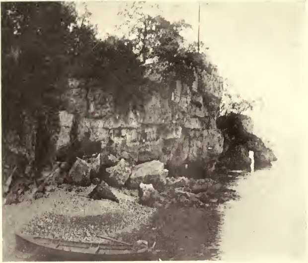
"PERRY'S LOOKOUT" ON GIBRALTER ROCK