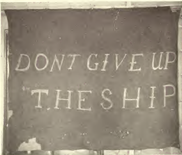
PERRY'S FAMOUS BATTLE FLAG Preserved in the Naval Academy, Annapolis