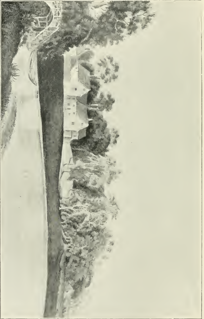
BRADFIELD HALL AS IN ARTHUR YOUNG'S TIME.