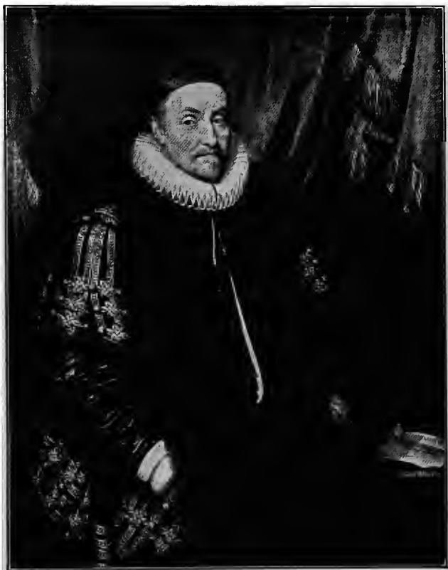
WILLIAM OF ORANGE.

Painting by M. J. Mierevelt, in the Rijks Museum, Amsterdam.