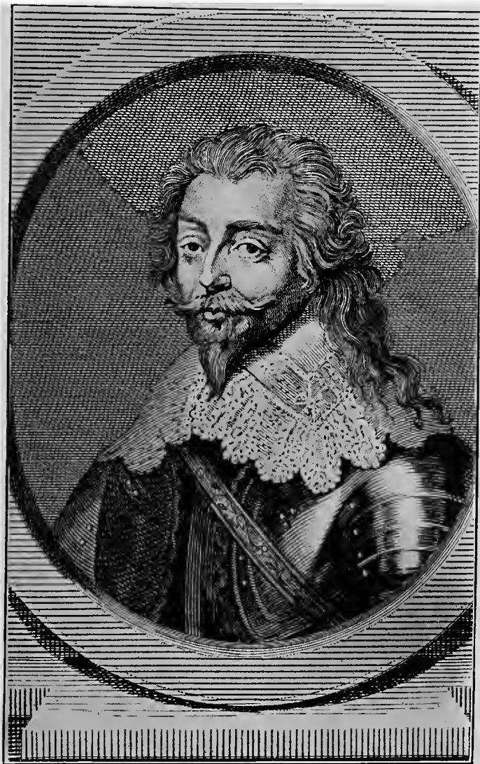
PRINCE OF CONDÉ