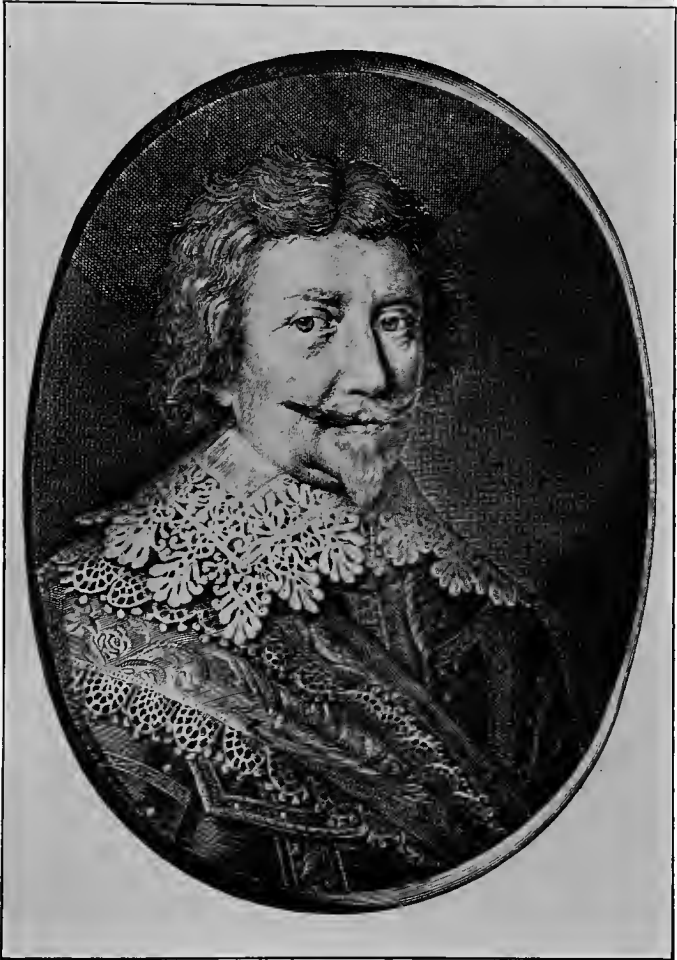
PRINCE FREDERICK HENRY