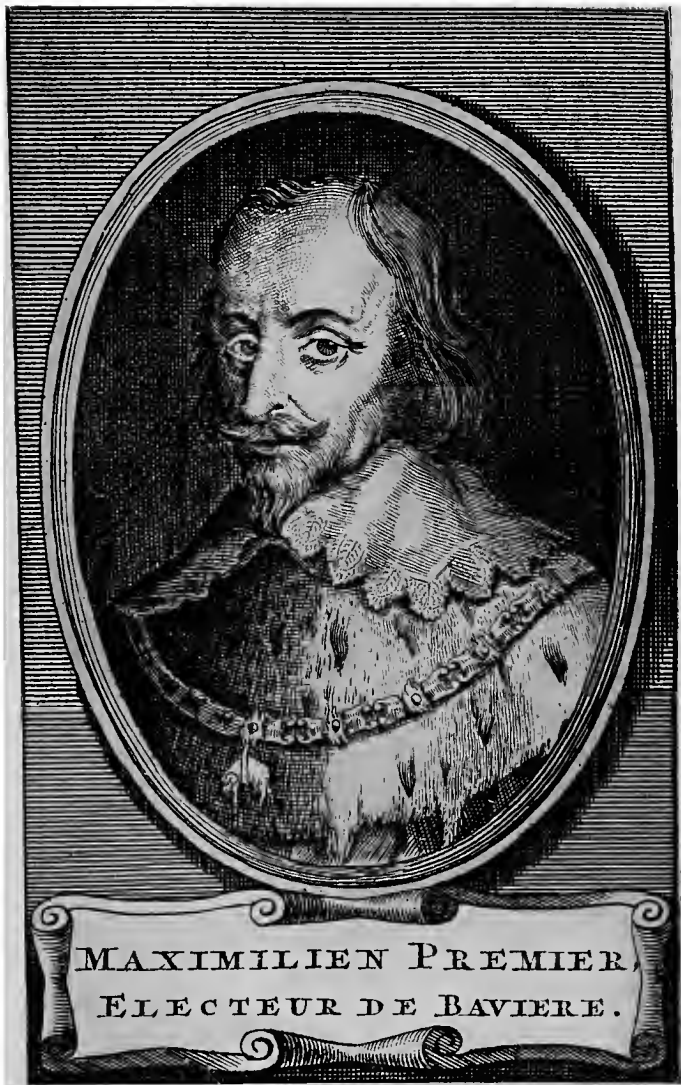
MAXIMILIEN PREMIER. ELECTEUR DE BAVIERE.