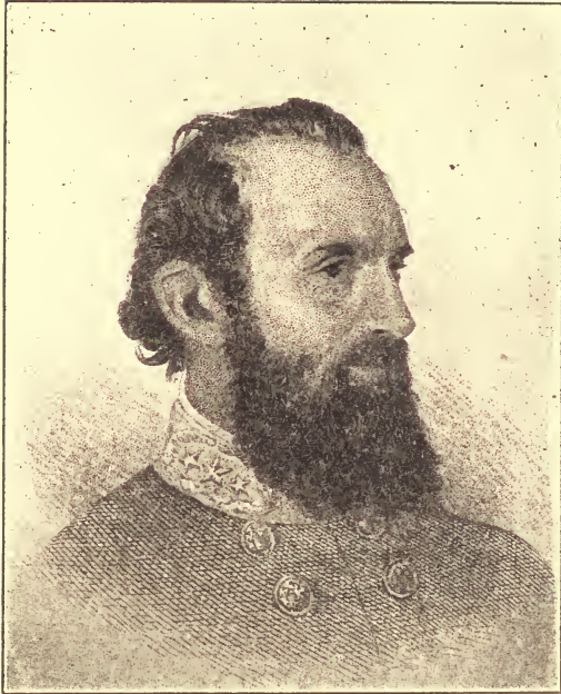
LIEUTENANT-GENERAL THOMAS JONATHAN JACKSON